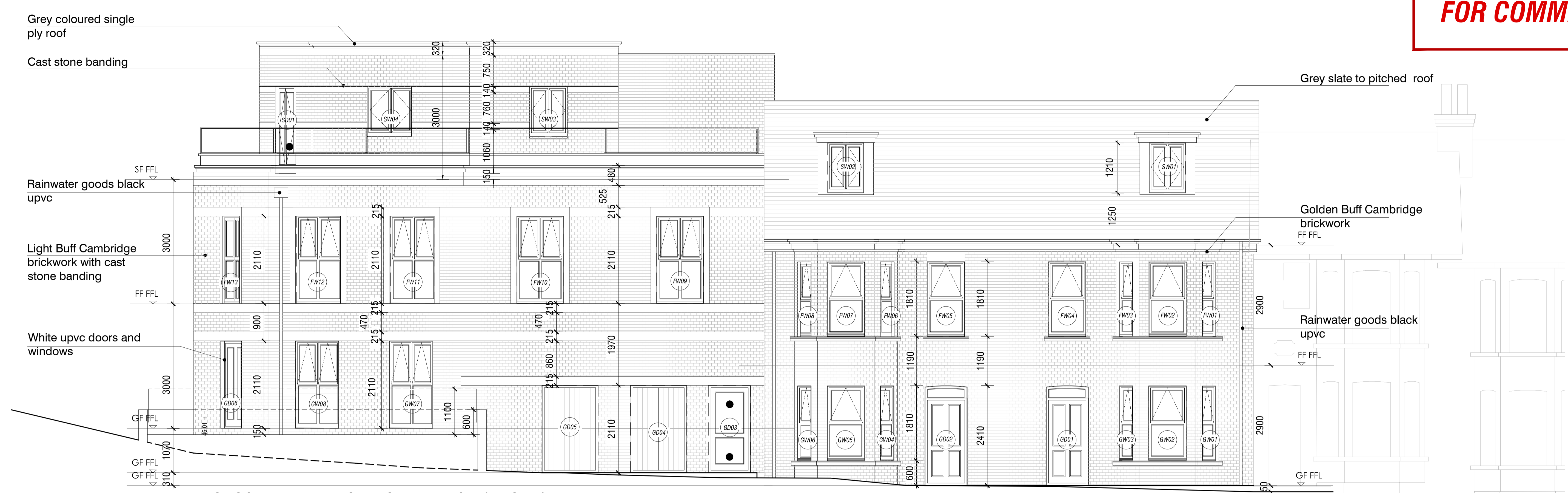
PROPOSED ELEVATION NORTH WEST (FRONT) Proposed | 1:50