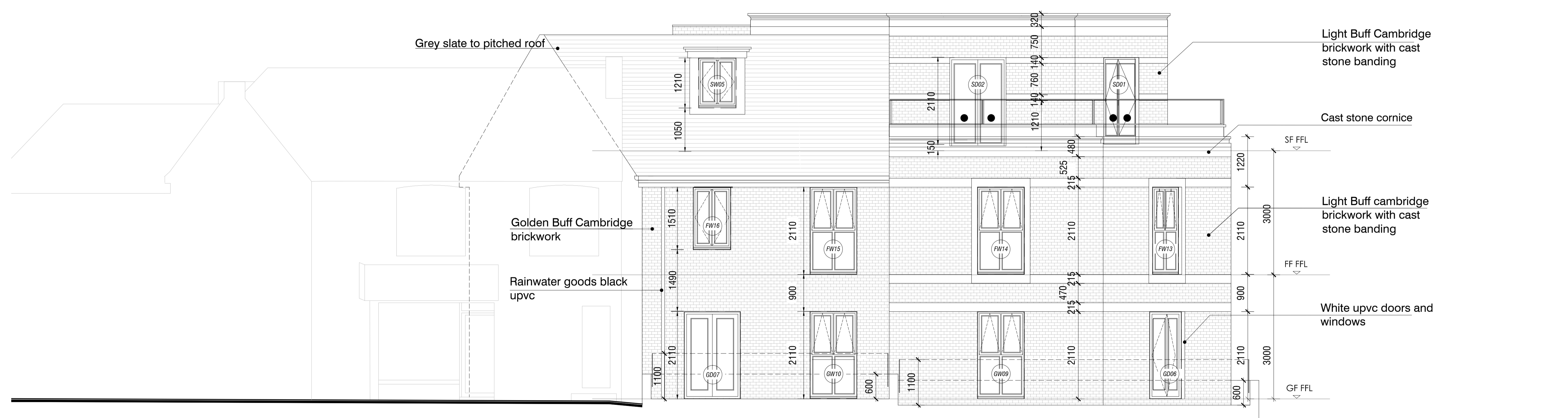
PROPOSED ELEVATION NORTH EAST (SIDE 1) Proposed | 1:50