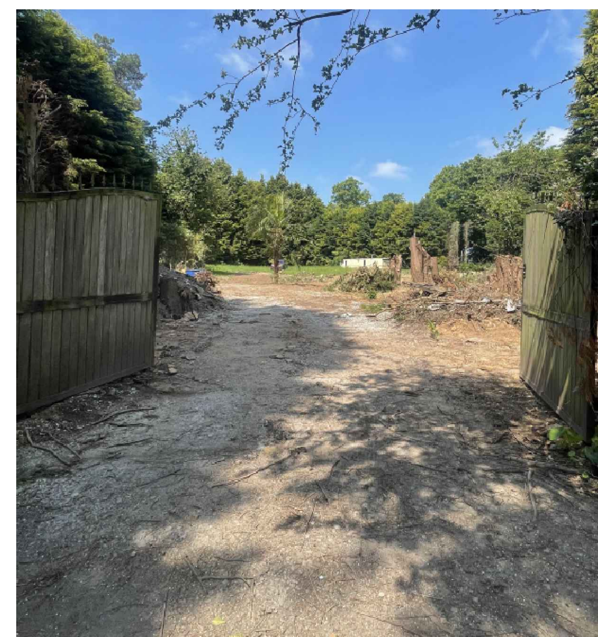
View 1. Existing access gate into site, track is to be improved.