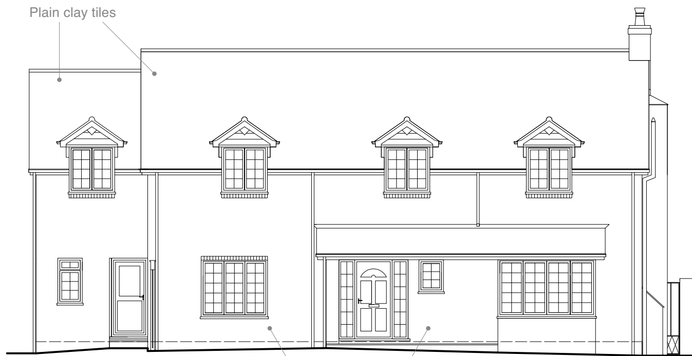
1 North Elevation 02 Scale: 1:100