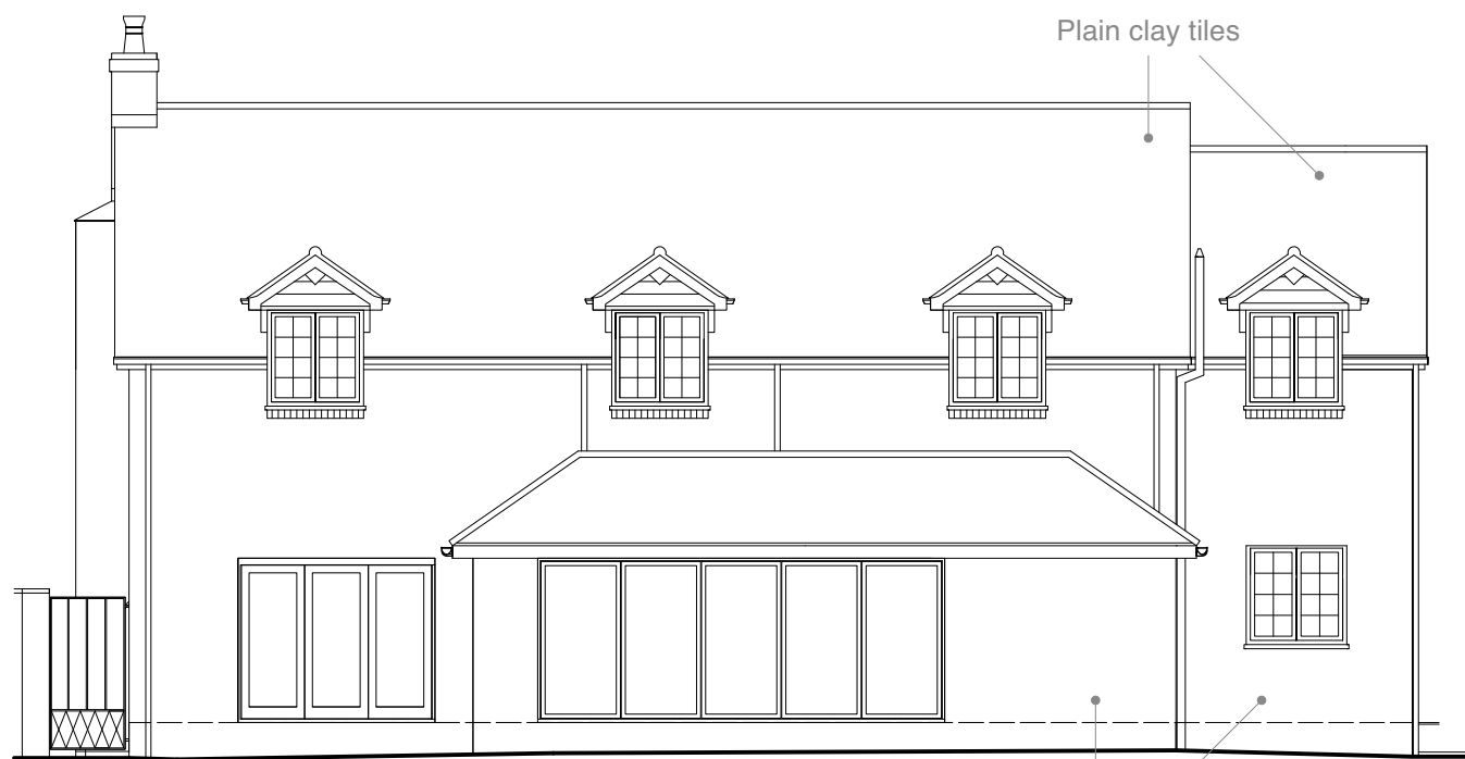
3 South Elevation 02 Scale: 1:100