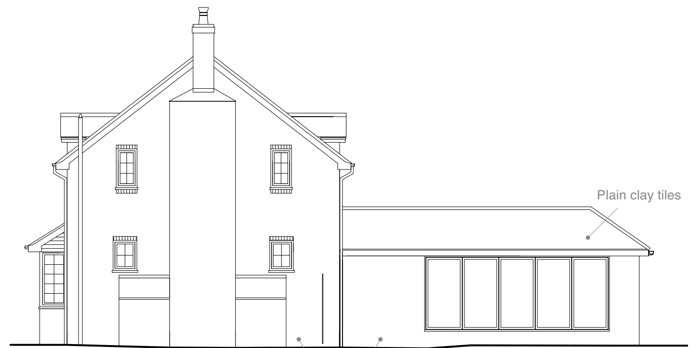
4 West Elevation 02 Scale: 1:100

Rev B - 20/06/23 - Corrected fenestration.