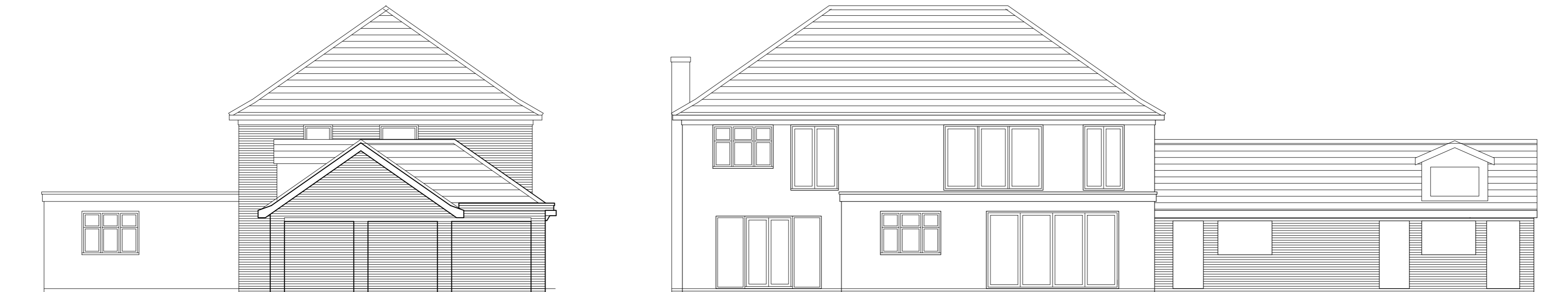
EXISTING SIDE ELEVATION SURVEY DRAWINGS