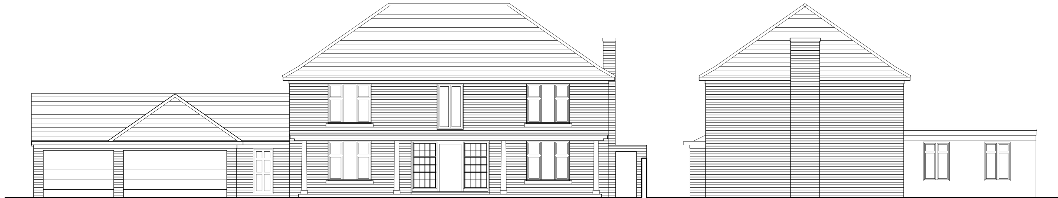
EXISTING FRONT ELEVATION SURVEY DRAWINGS

WWW.TAILOREDDDESIGNS.CO.UK 07771701692 RYAN@TAILOREDDDESIGNS.CO.UK