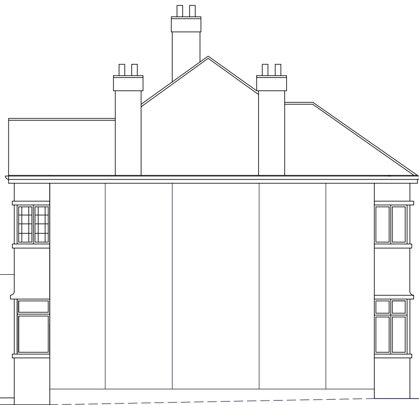
SIDE ELEVATION (north)