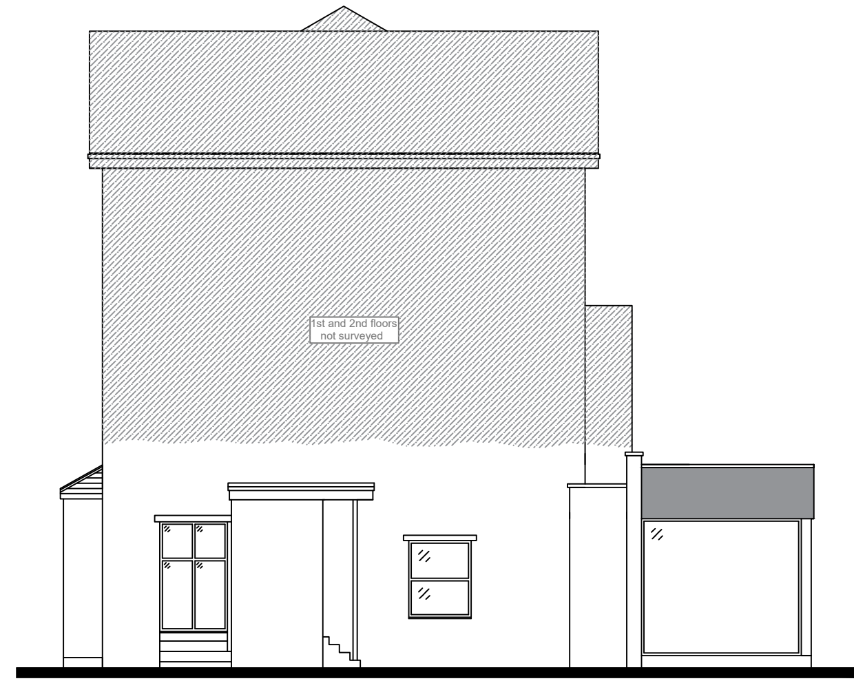
Side Elevation Scale 1:100