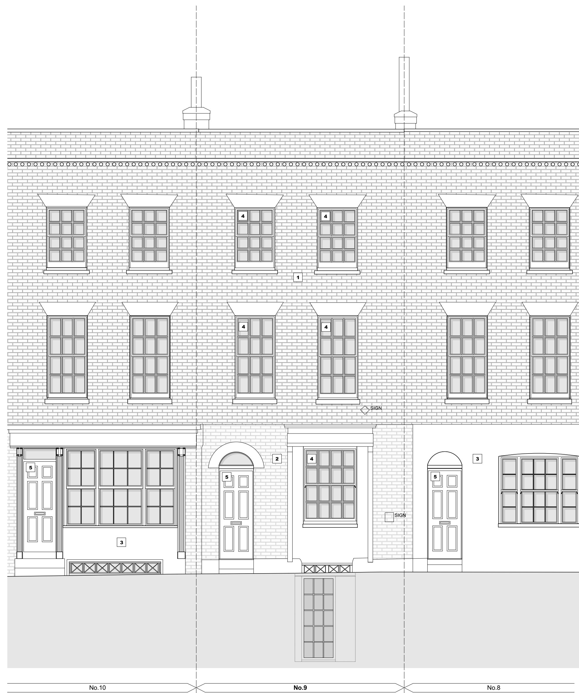
1 Existing Front Elevation 000_301 1:50 @ A1 / 1:100 @ A3