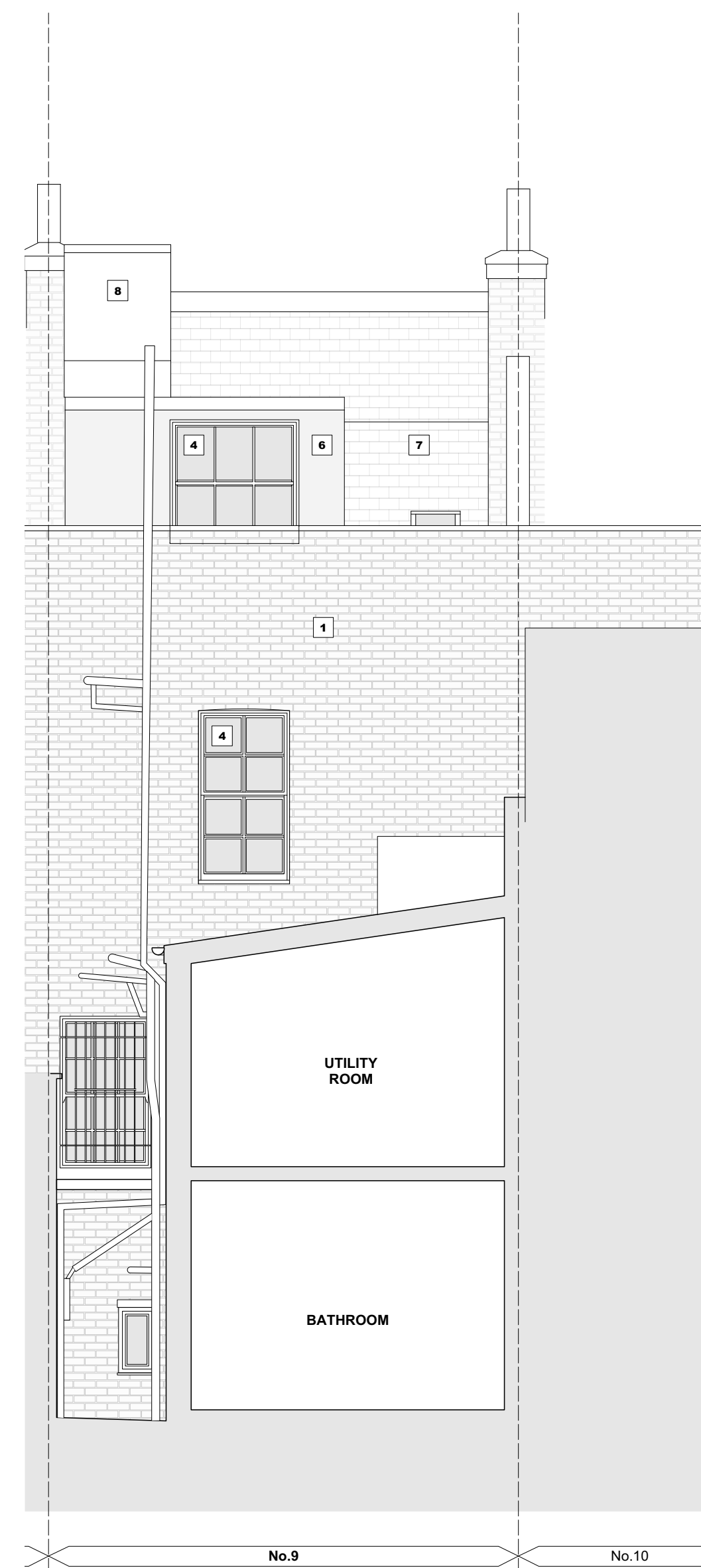
2 Existing Rear Elevation 000_301 1:50 @ A1 / 1:100 @ A3