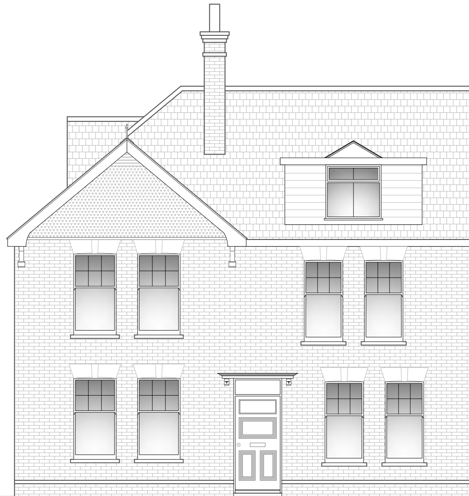
Existing Front (E) Elevation 1:50