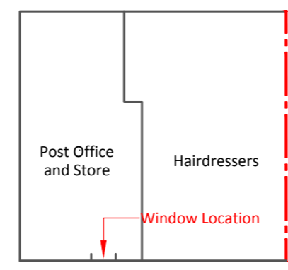
Site Plan 1:200