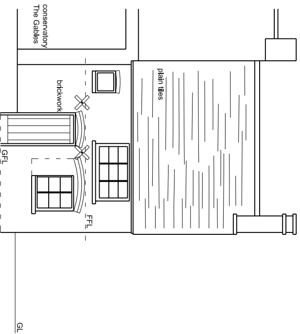
rear elevation NW