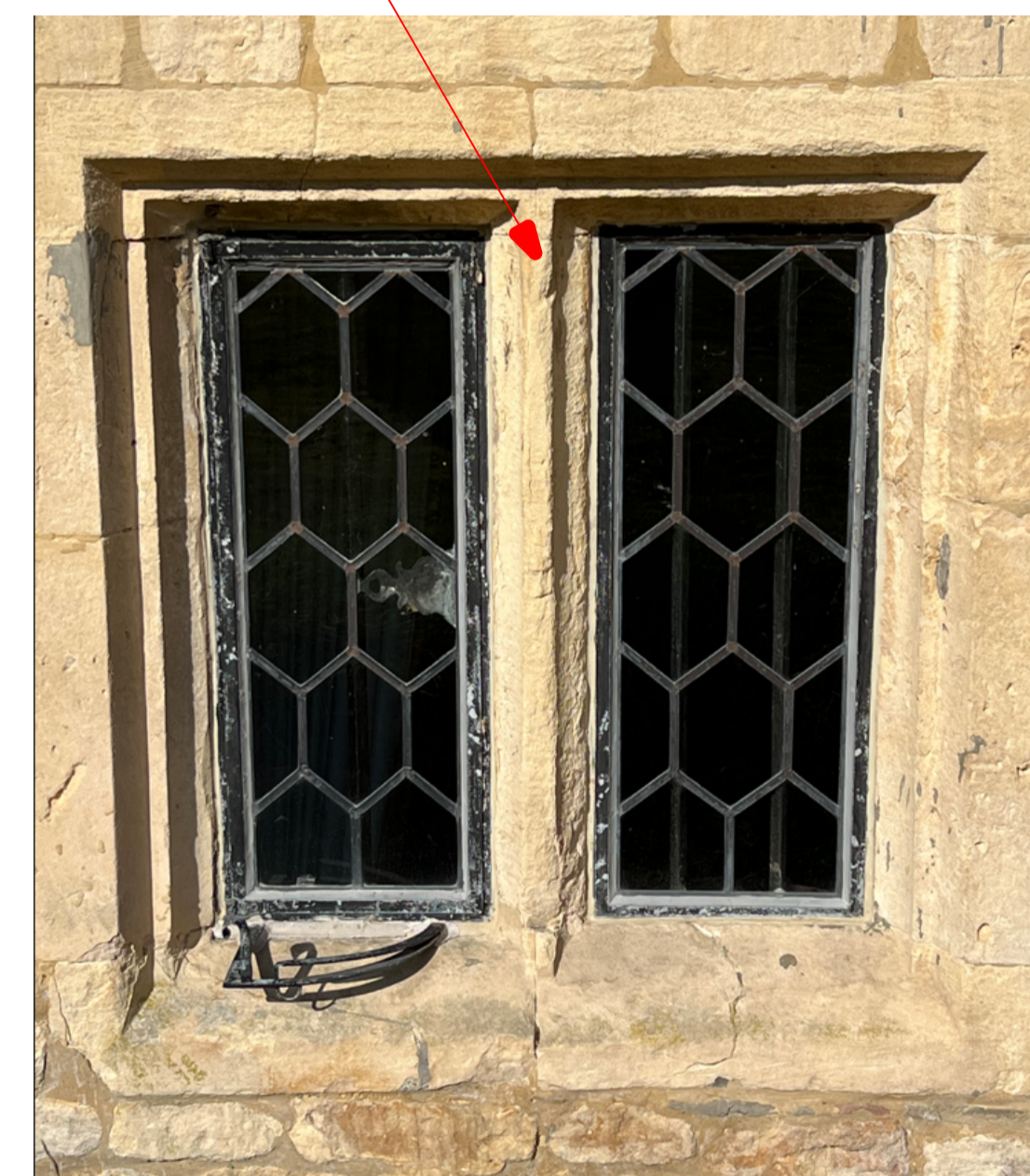
WG31 FRONT VIEW AS EXISTING PHOTO SHOWING THE DETERIORATION OF THE MULLION TO BE REPLACED