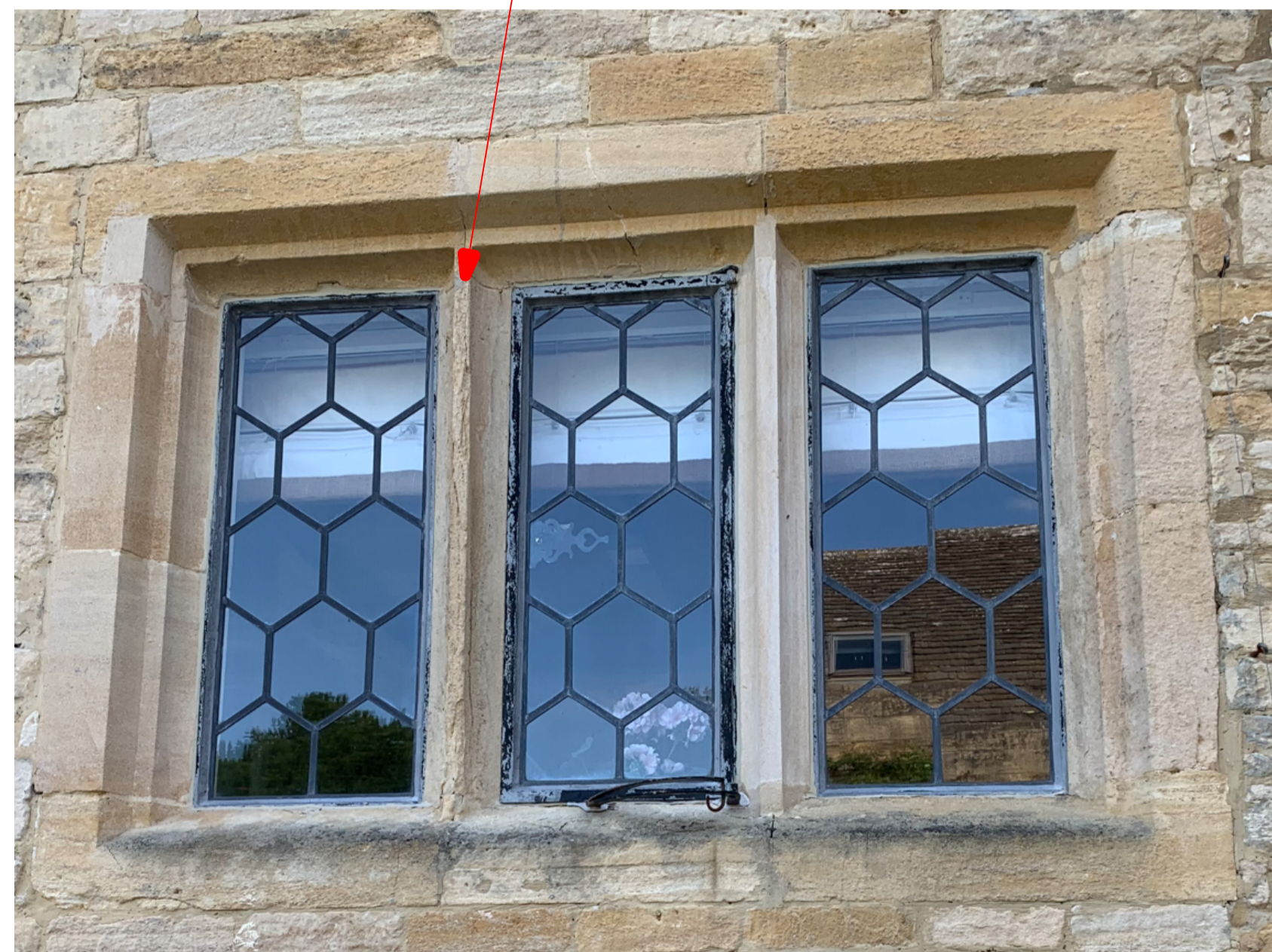
WG26 FRONT VIEW AS EXISTING PHOTO SHOWING THE DETERIORATION OF THE LEFT MULLION TO BE REPLACED