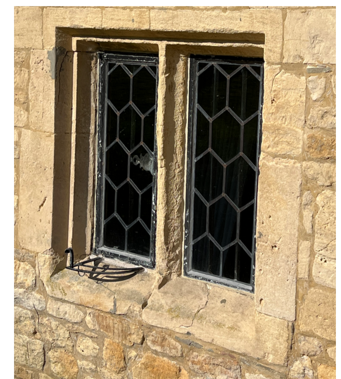
WG31 SIDE VIEW AS EXISTING PHOTO SHOWING THE DETERIORATION OF THE MULLION TO BE REPLACED