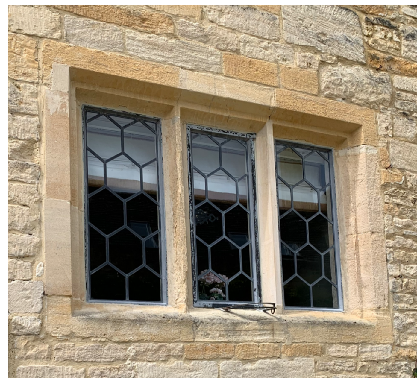
WG26 SIDE VIEW AS EXISTING PHOTO SHOWING THE DETERIORATION OF THE LEFT MULLION TO BE REPLACED