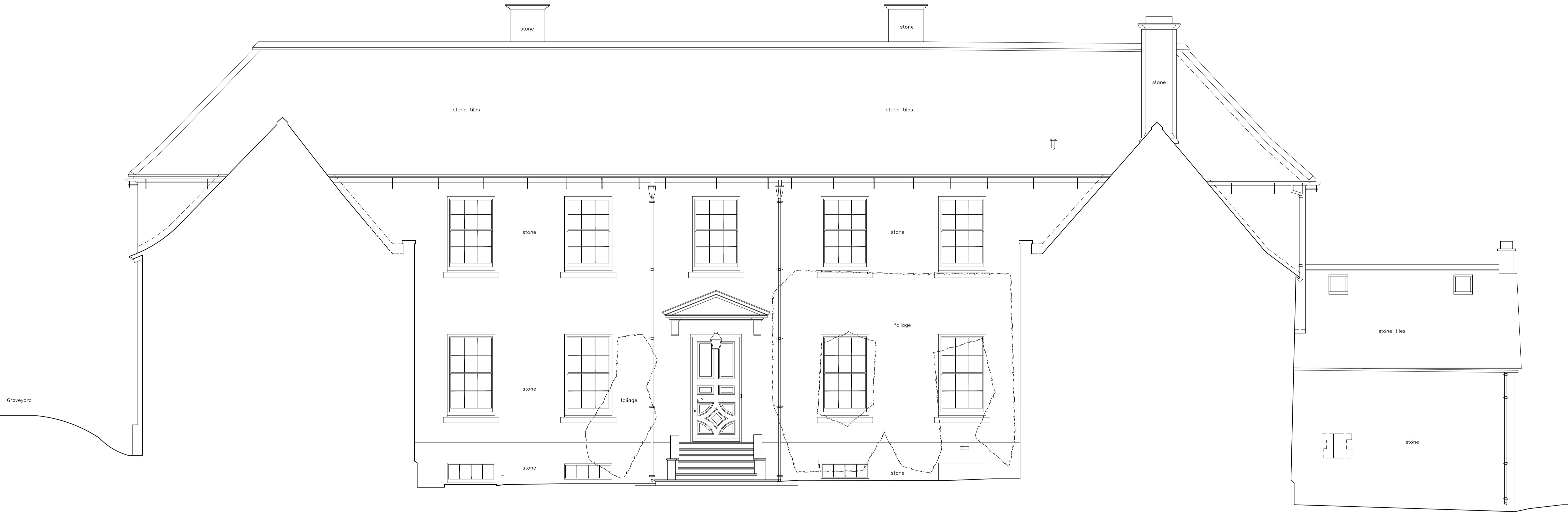
SOUTH EAST ELEVATION Δ 154.00m A.O.D

THIS SURVEY HAS BEEN PREPARED WITH A SCALING ACCURACY FOR A PLOT AT A SCALE OF 1/50 THE CO-ORDINATES ARE DERIVED FROM THE ORDNANCE SURVEY ACTIVE STATION NETWORK OSTN15 (BASE STATION ST01)