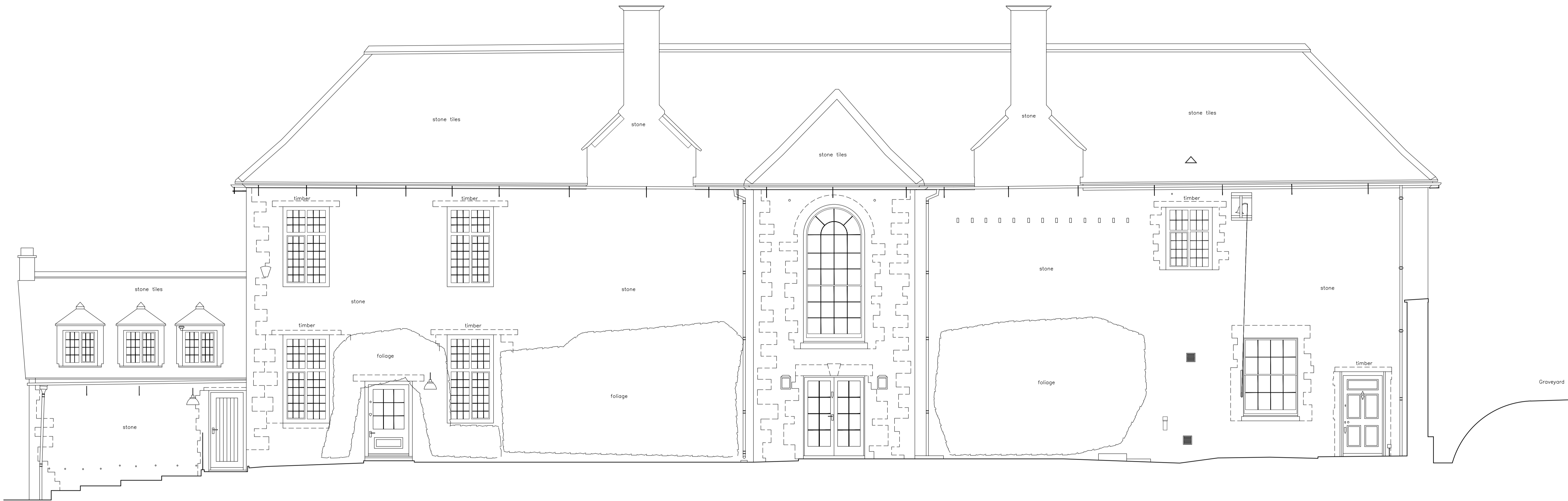
NORTH WEST ELEVATION 154.00m A.O.D

THIS SURVEY HAS BEEN PREPARED WITH A SCALING ACCURACY FOR A PLOT AT A SCALE OF 1/50 THE CO-ORDINATES ARE DERIVED FROM THE ORDNANCE SURVEY ACTIVE STATION NETWORK OSTN15 (BASE STATION ST01)