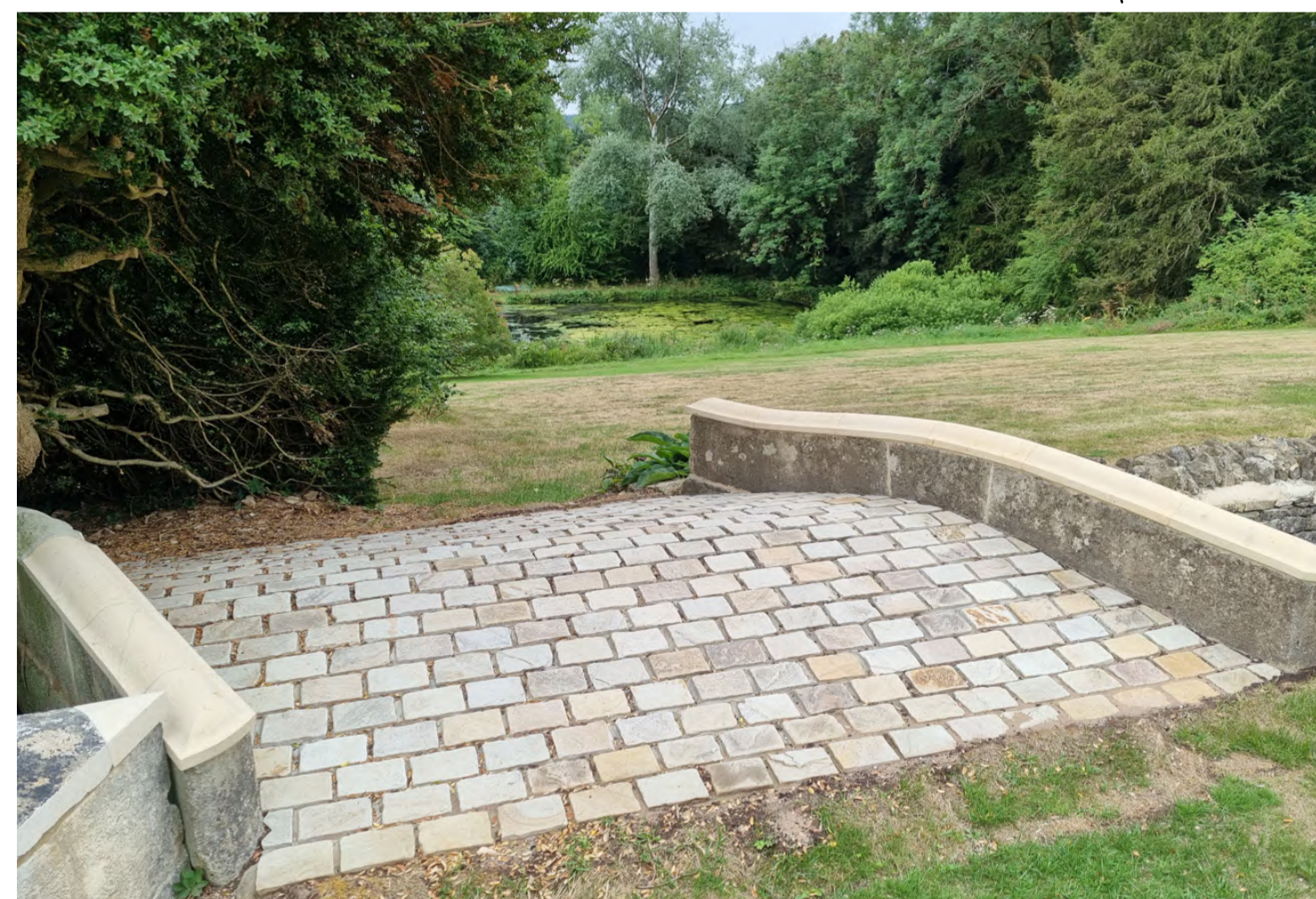
PHOTO OVERLOOKING POND FROM COURTYARD