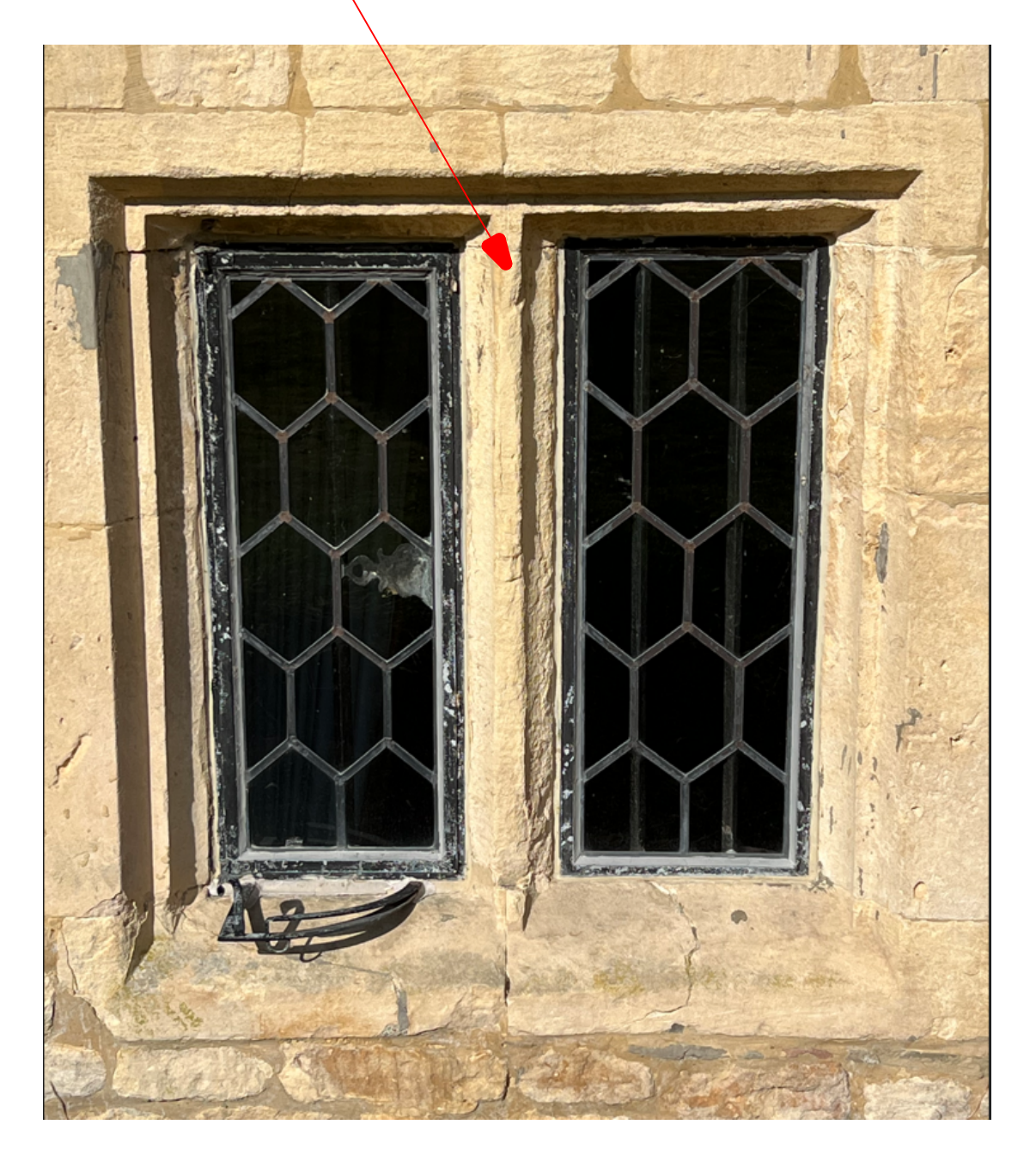
WG31 FRONT VIEW AS EXISTING PHOTO SHOWING THE DETERIORATION OF THE MULLION TO BE REPLACED