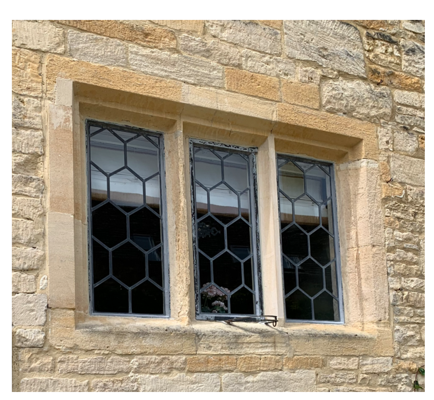
WG26 SIDE VIEW AS EXISTING PHOTO SHOWING THE DETERIORATION OF THE LEFT MULLION TO BE REPLACED