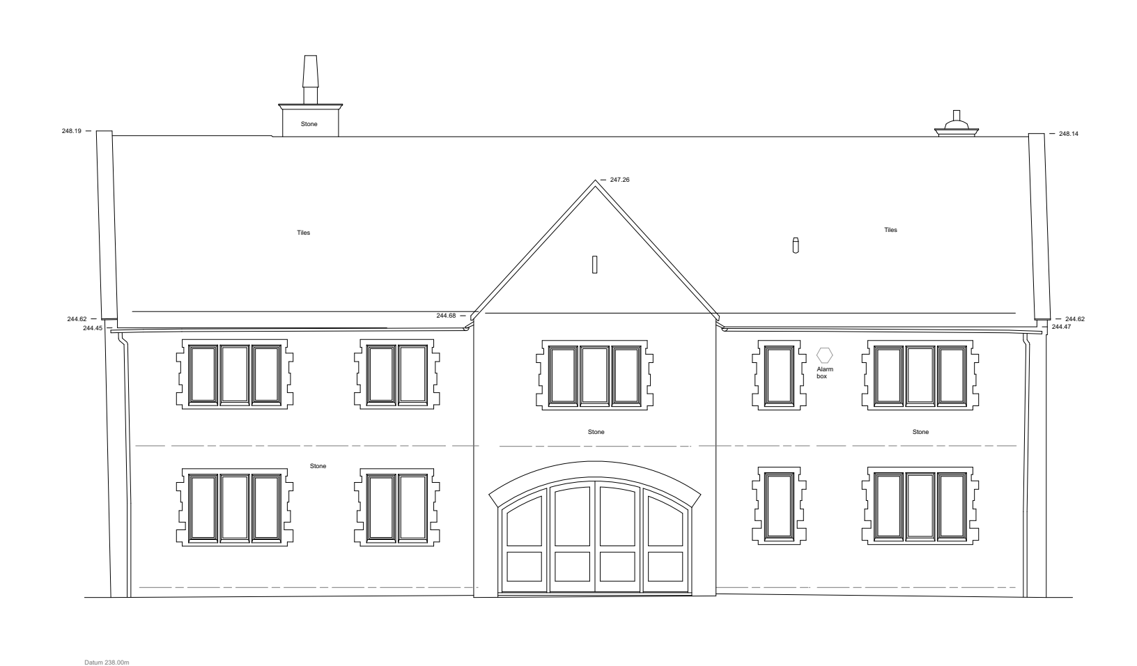
WEST ELEVATION AS EXISTING