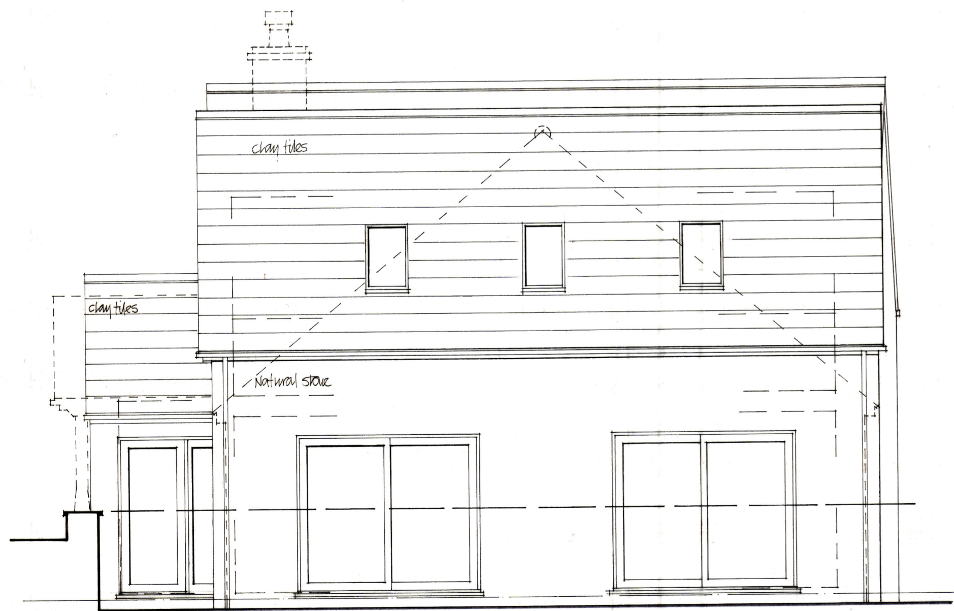
PROPOSED EAST ELEVATION 1/50 @ A2