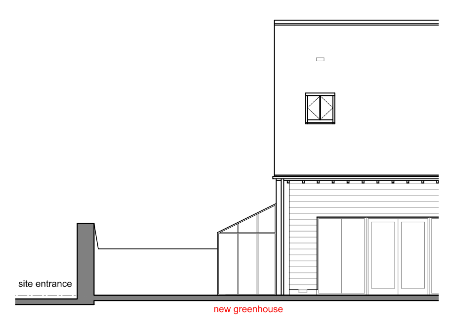
Part South (Rear) Elevation Scale 1:100 at A3