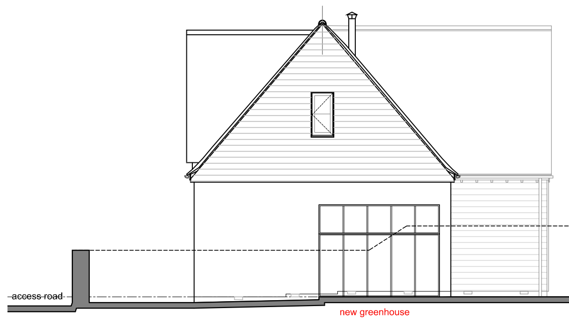
West (Side) Elevation Scale 1:100 at A3