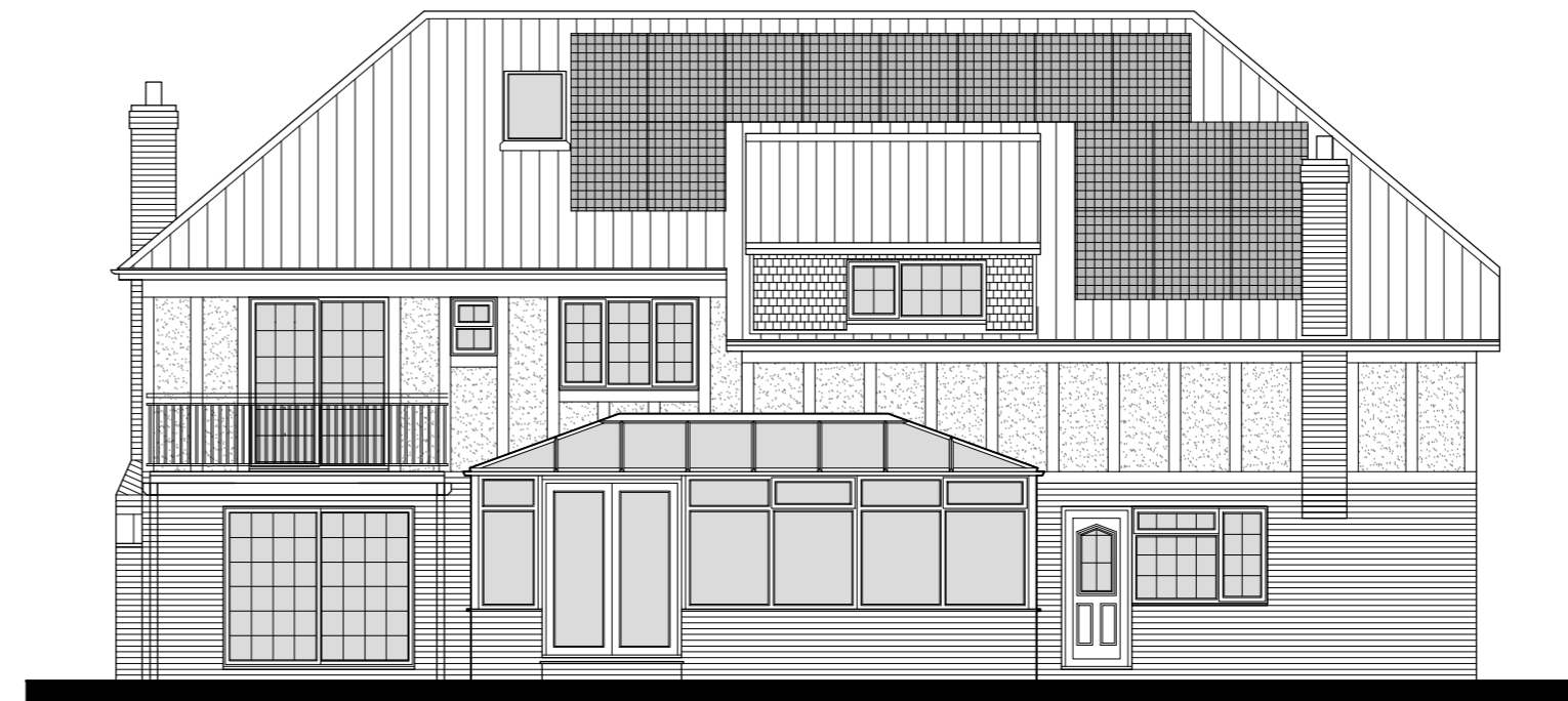
SOUTH ELEVATION Scale - 1:100