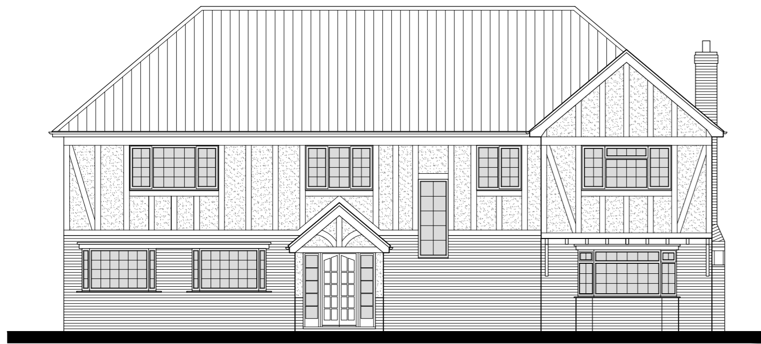
NORTH ELEVATION Scale - 1:100