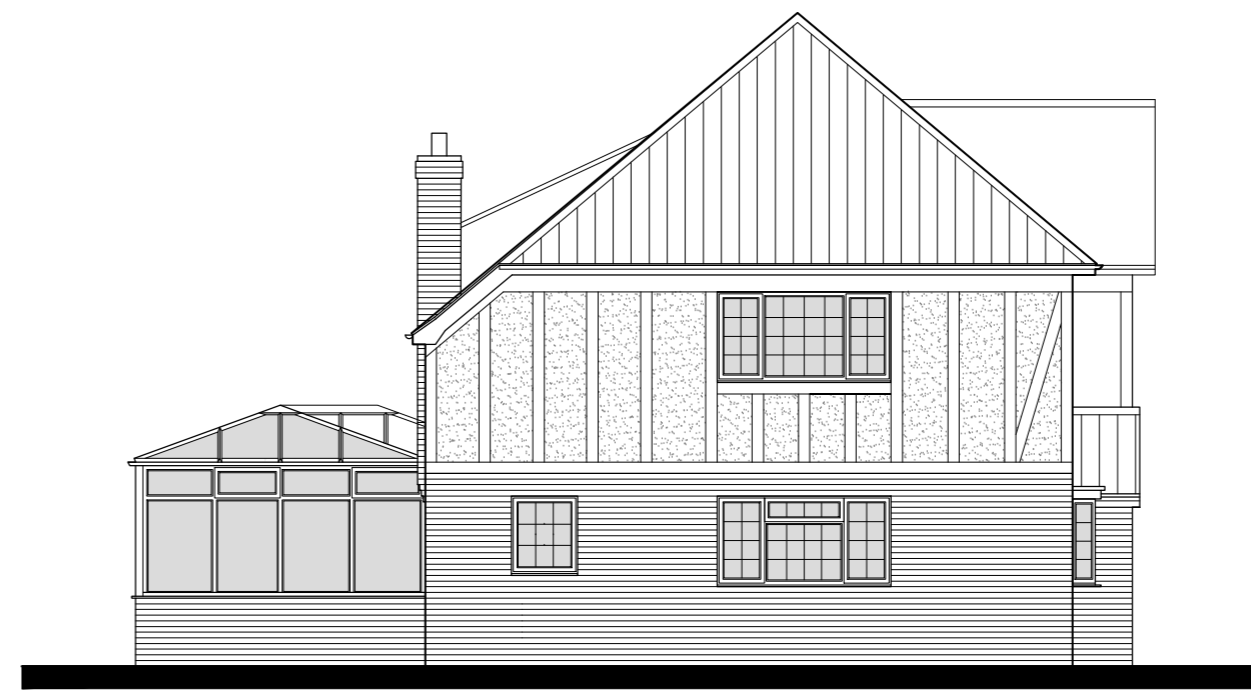
EAST ELEVATION Scale - 1:100