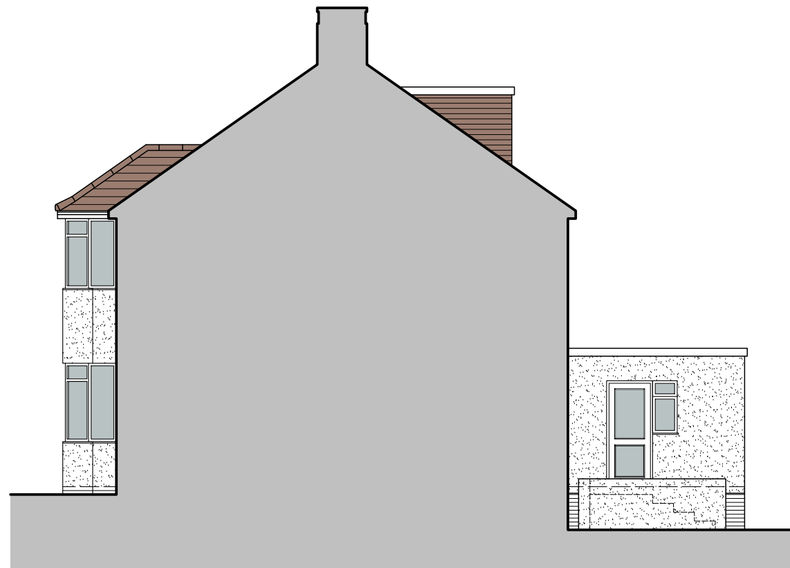
Existing Side Elevation Scale 1:100