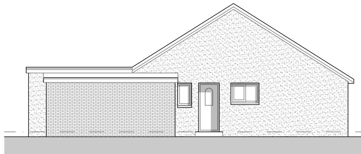
EXISTING SIDE ELEVATION | 1:100