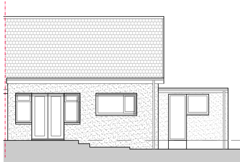
EXISTING REAR ELEVATION | 1:100