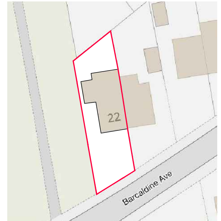
EXISTING BLOCK PLAN | 1:500