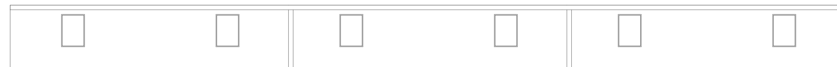
E-14 22-601-117 Elevation 1:100