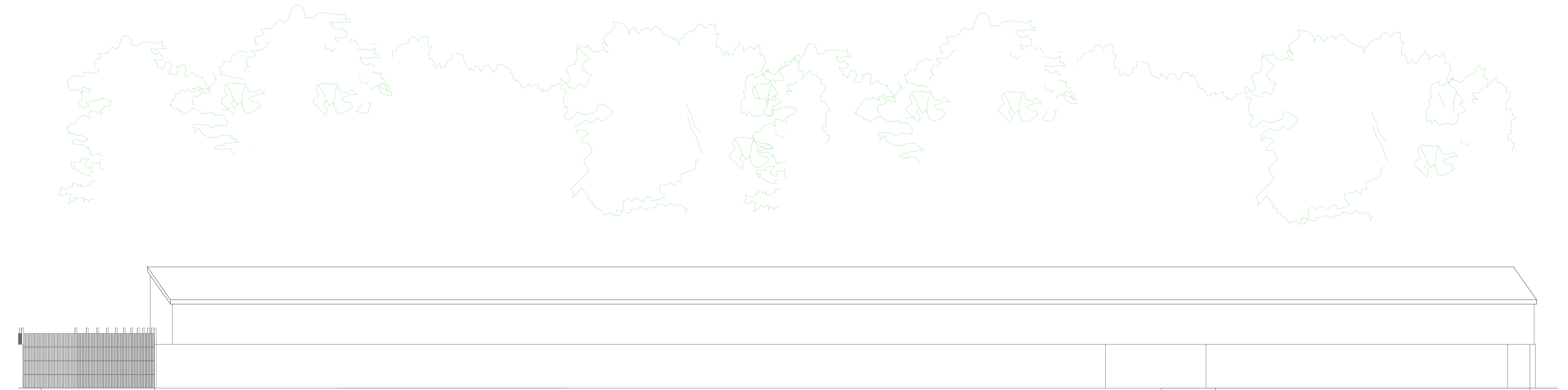
E-06 22-601-113 Elevation 1:100