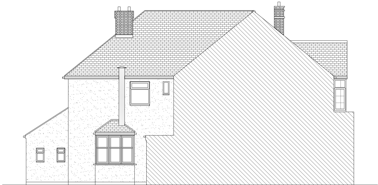
RIGHT FLANK ELEVATION