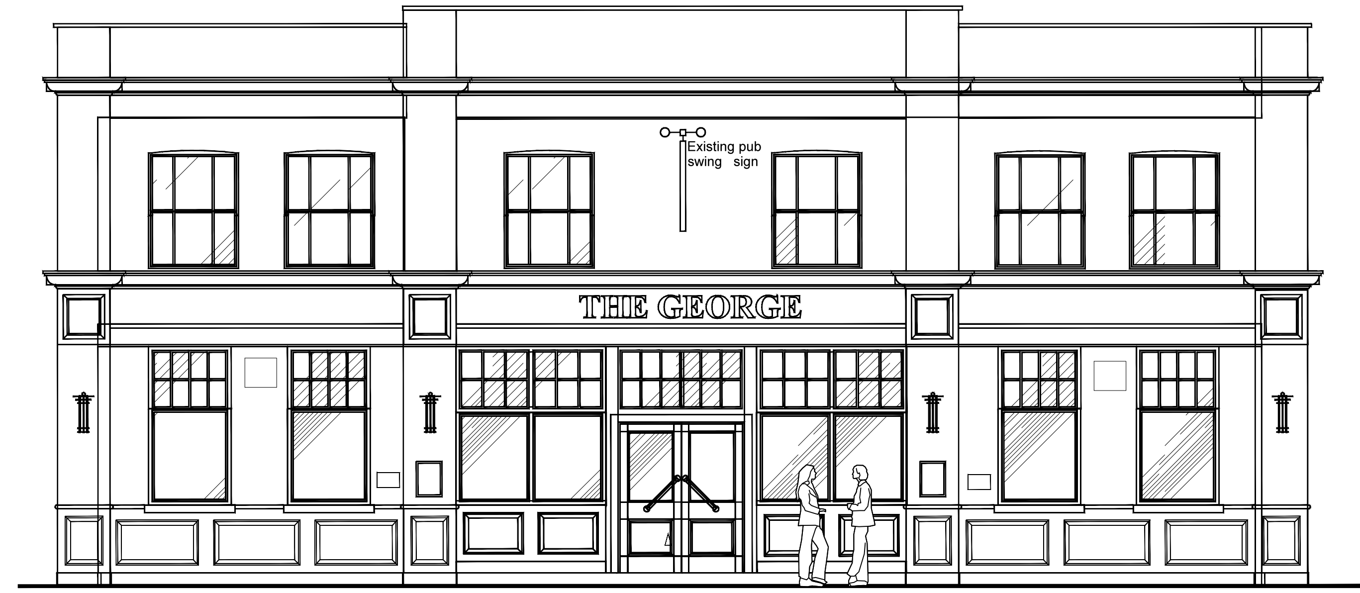
A PROPOSED FRONT ELEVATION ( No Change ) Scale: 1:50