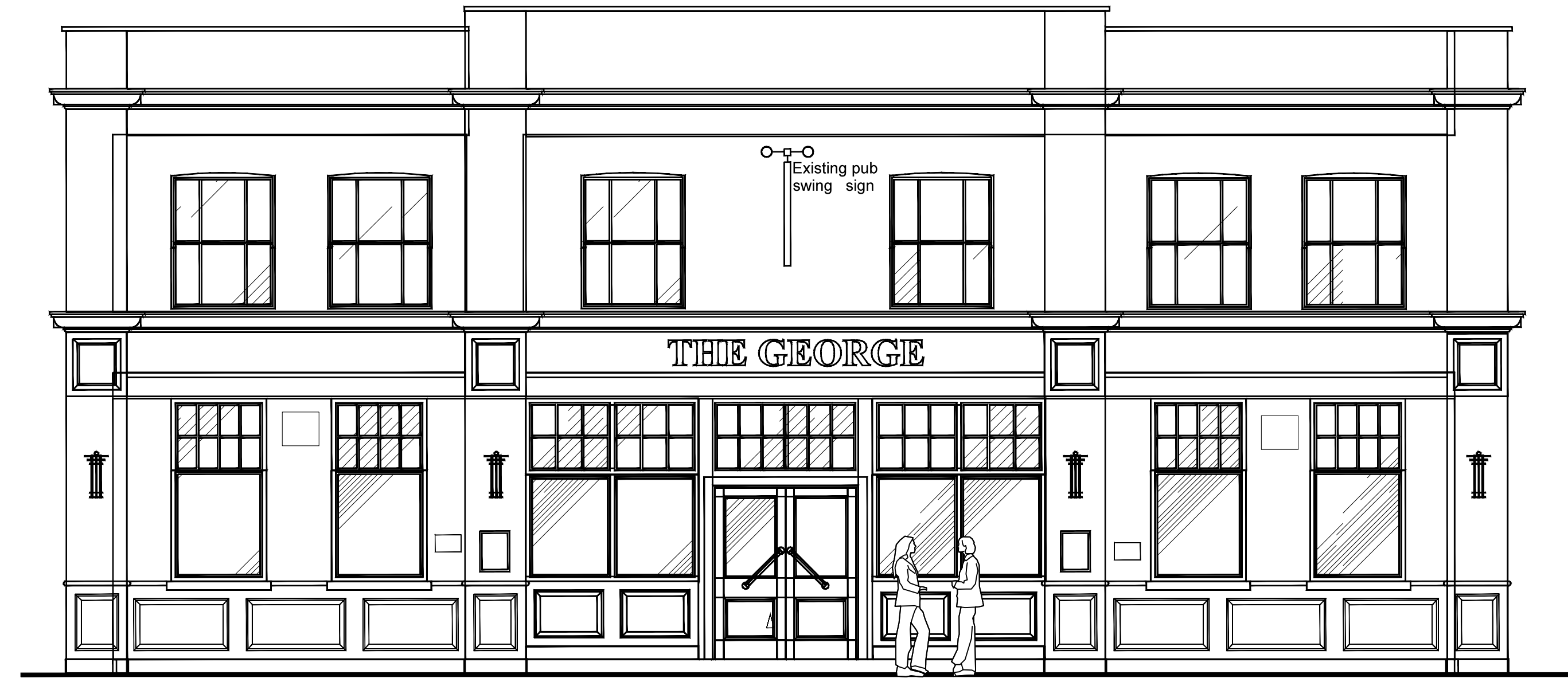
A EXISTING FRONT ELEVATION Scale: 1:50