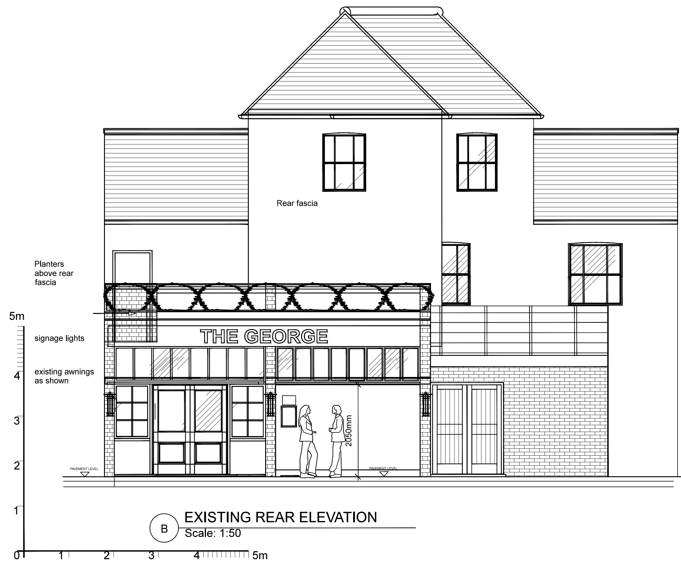
B EXISTING REAR ELEVATION Scale: 1:50