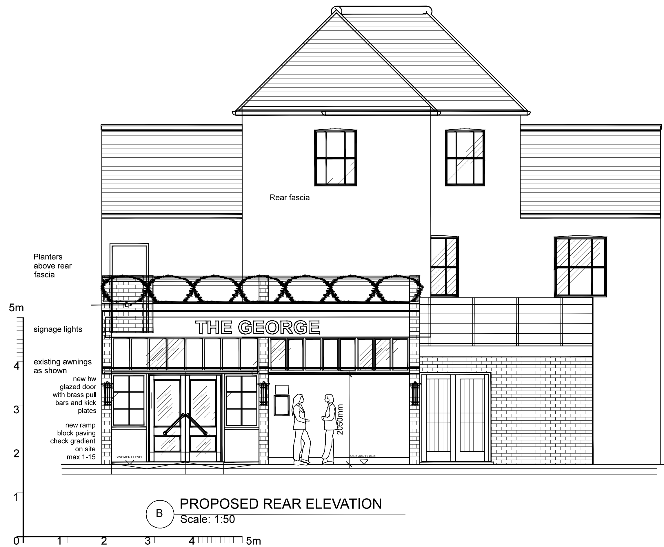
B PROPOSED REAR ELEVATION Scale: 1:50