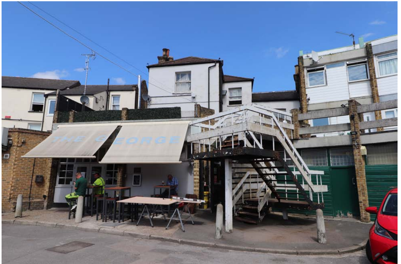
Rear seating area.