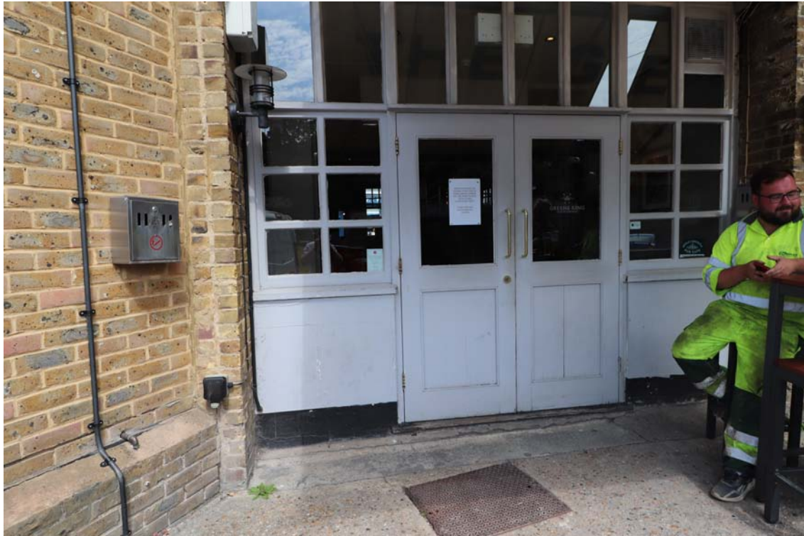
Rear location for ramped access.