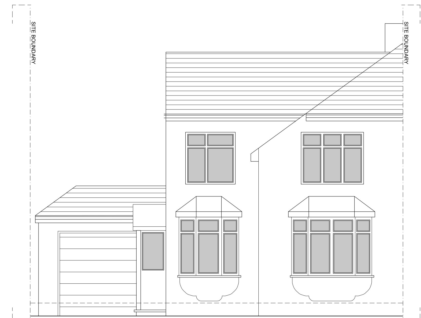
1/ EXISTING FRONT ELEVATION