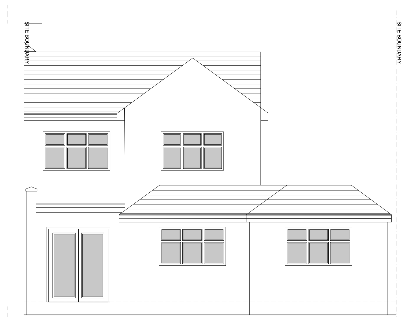
2/ EXISTING REAR ELEVATION