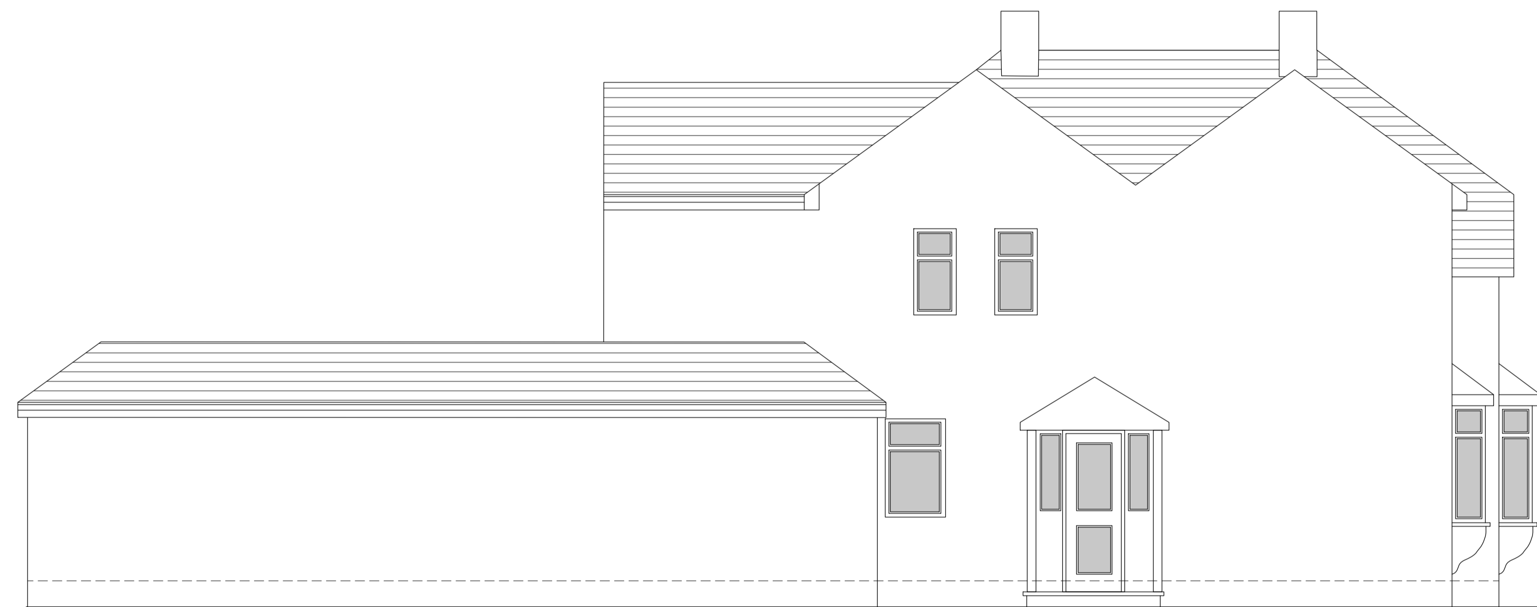
3/ EXISTING SIDE 1 ELEVATION