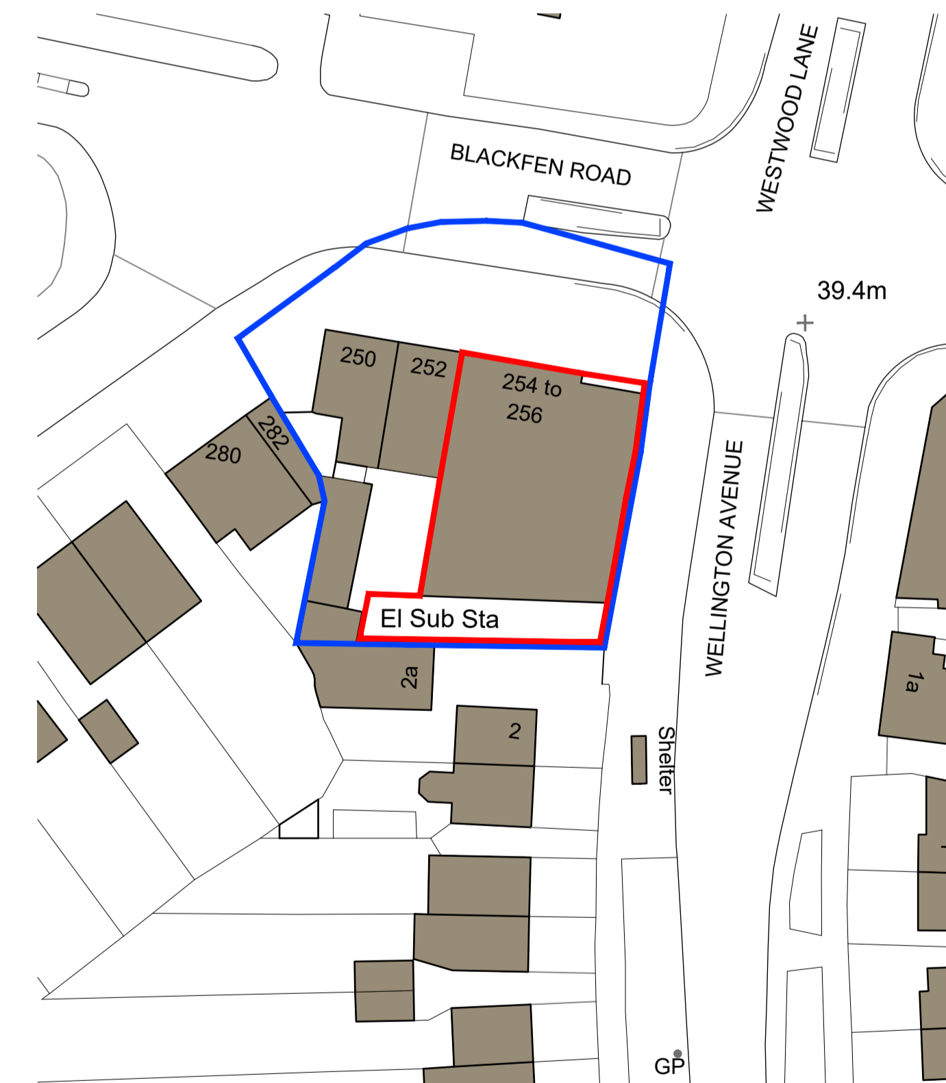
BLOCK PLAN (1:500)