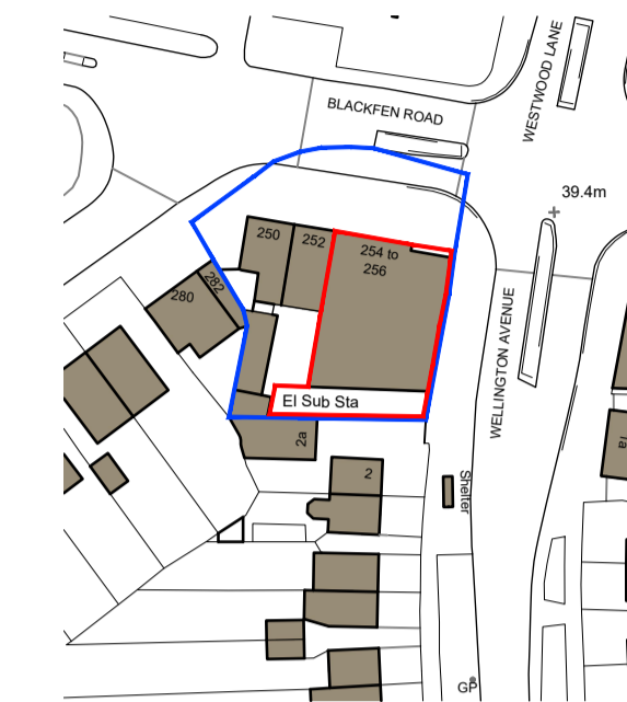
LOCATION PLAN (1:1250)