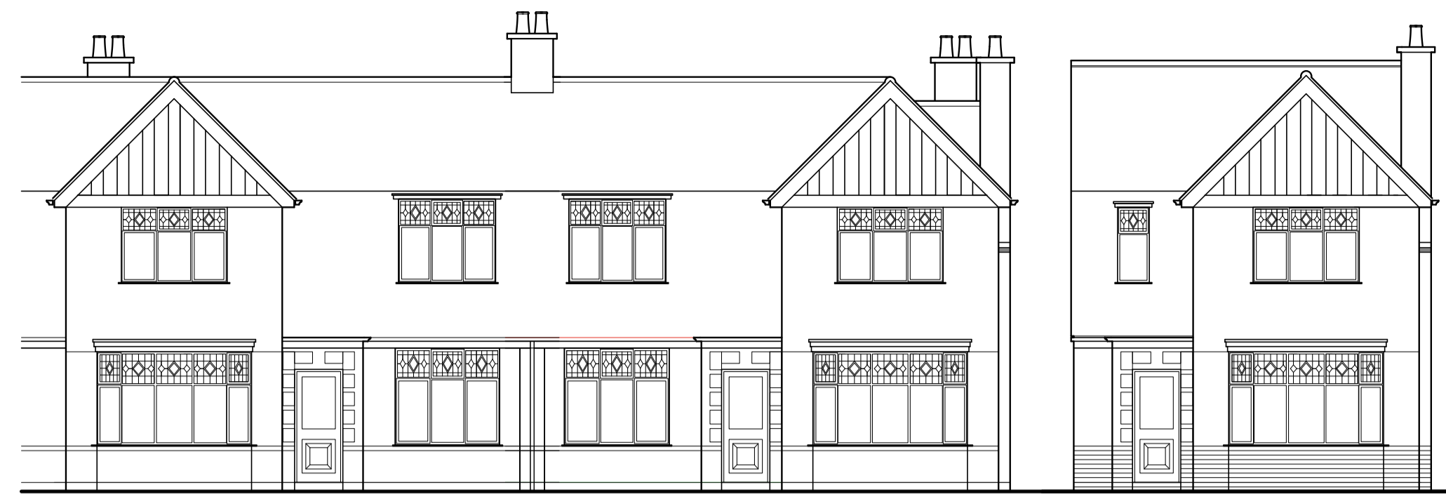
STREET SCENE ELEVATION SCALE 1:100