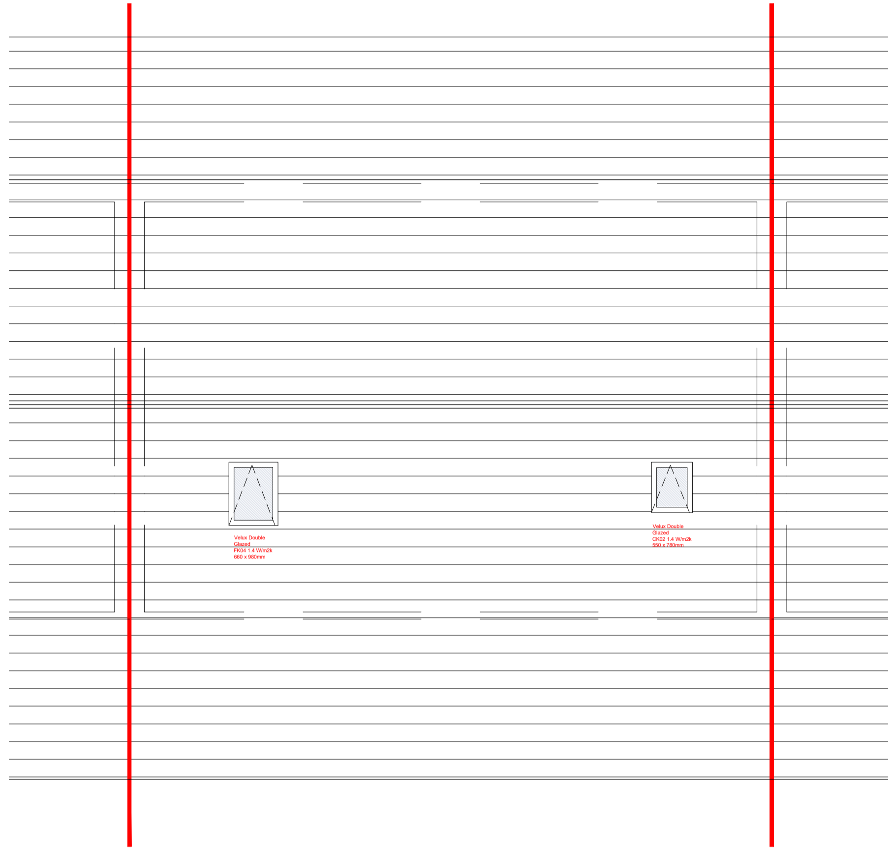
1 PROPOSED ROOF PLAN