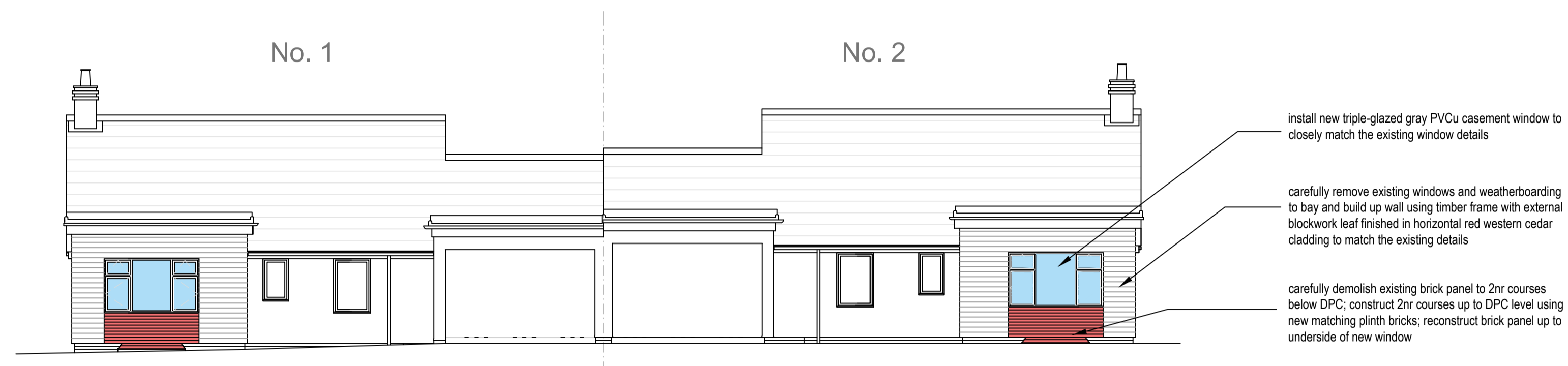
FRONT (WEST) ELEVATIONS