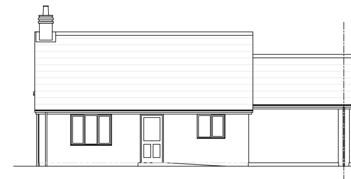
TYPICAL REAR ELEVATION