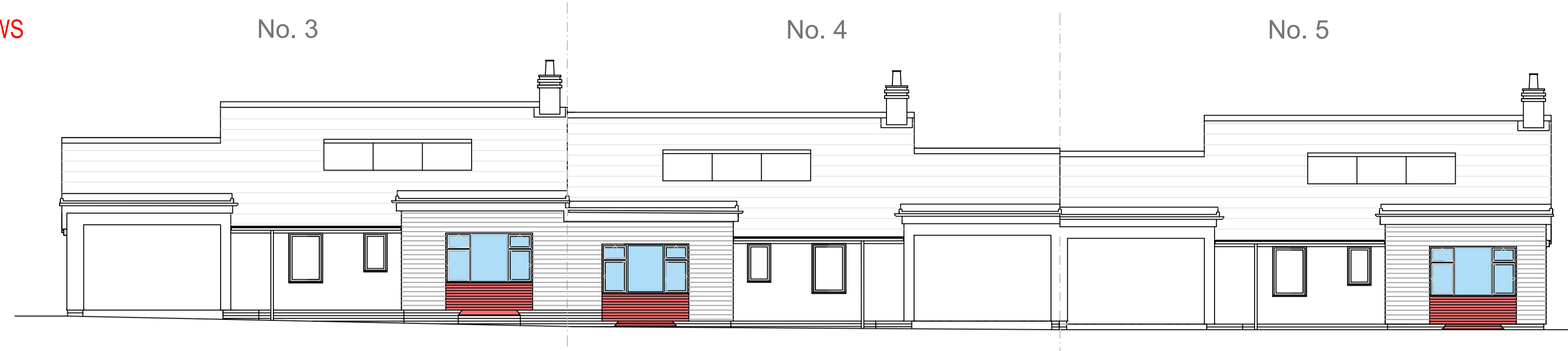
FRONT (EAST) ELEVATIONS

NOTE: PROPOSED WORKS TO BE COMPLETED TO ALL 5nr BUNGALOWS