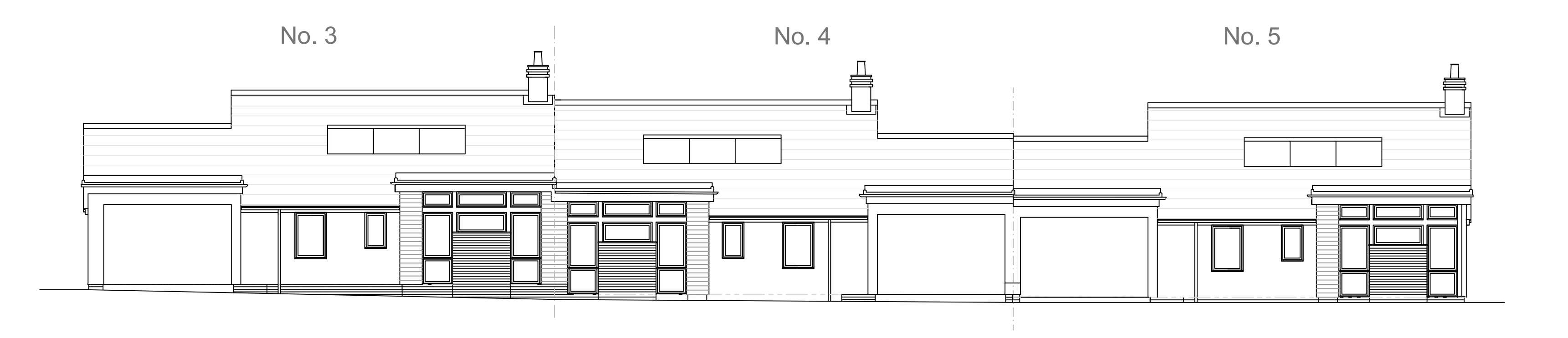
FRONT (EAST) ELEVATIONS