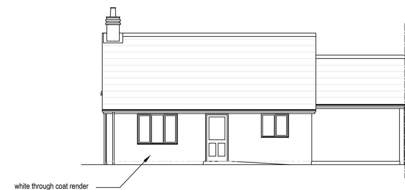
TYPICAL REAR ELEVATION