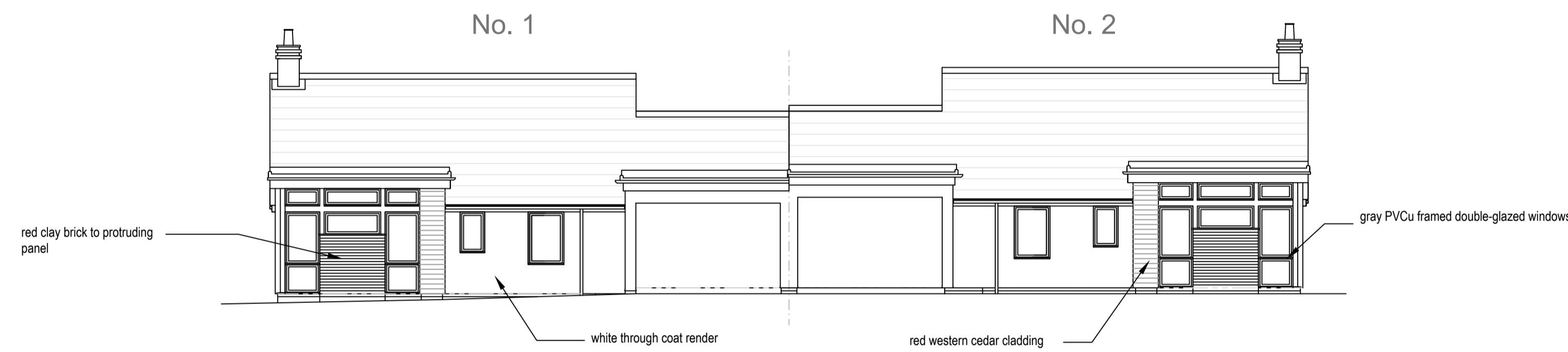
FRONT (WEST) ELEVATIONS