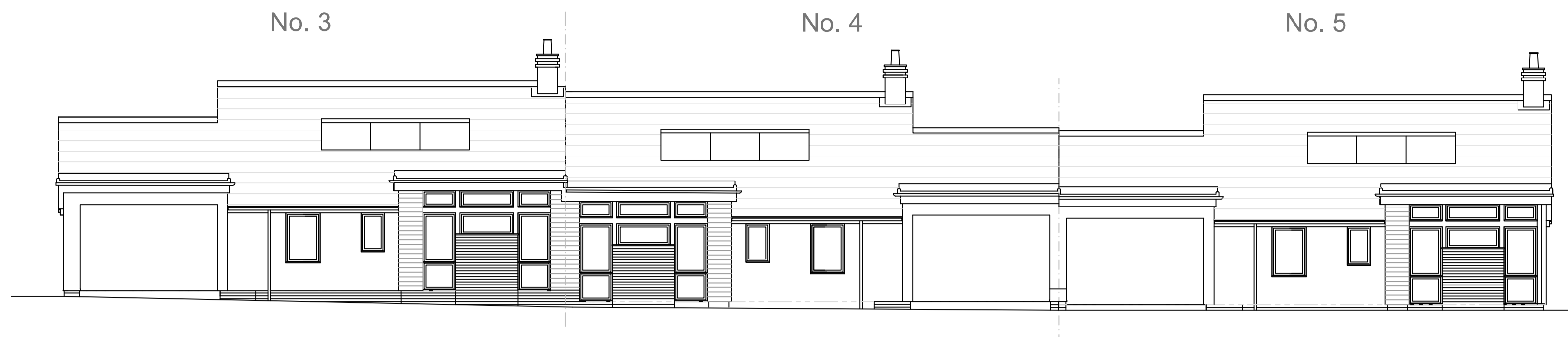
FRONT (EAST) ELEVATIONS