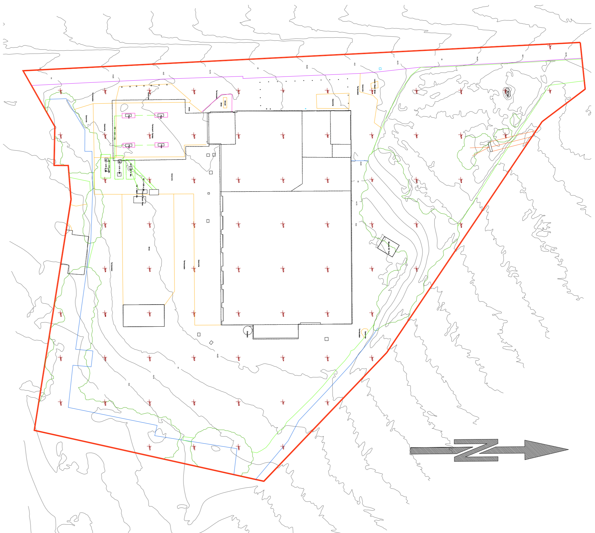
EXISTING BLOCK PLAN (1:500)