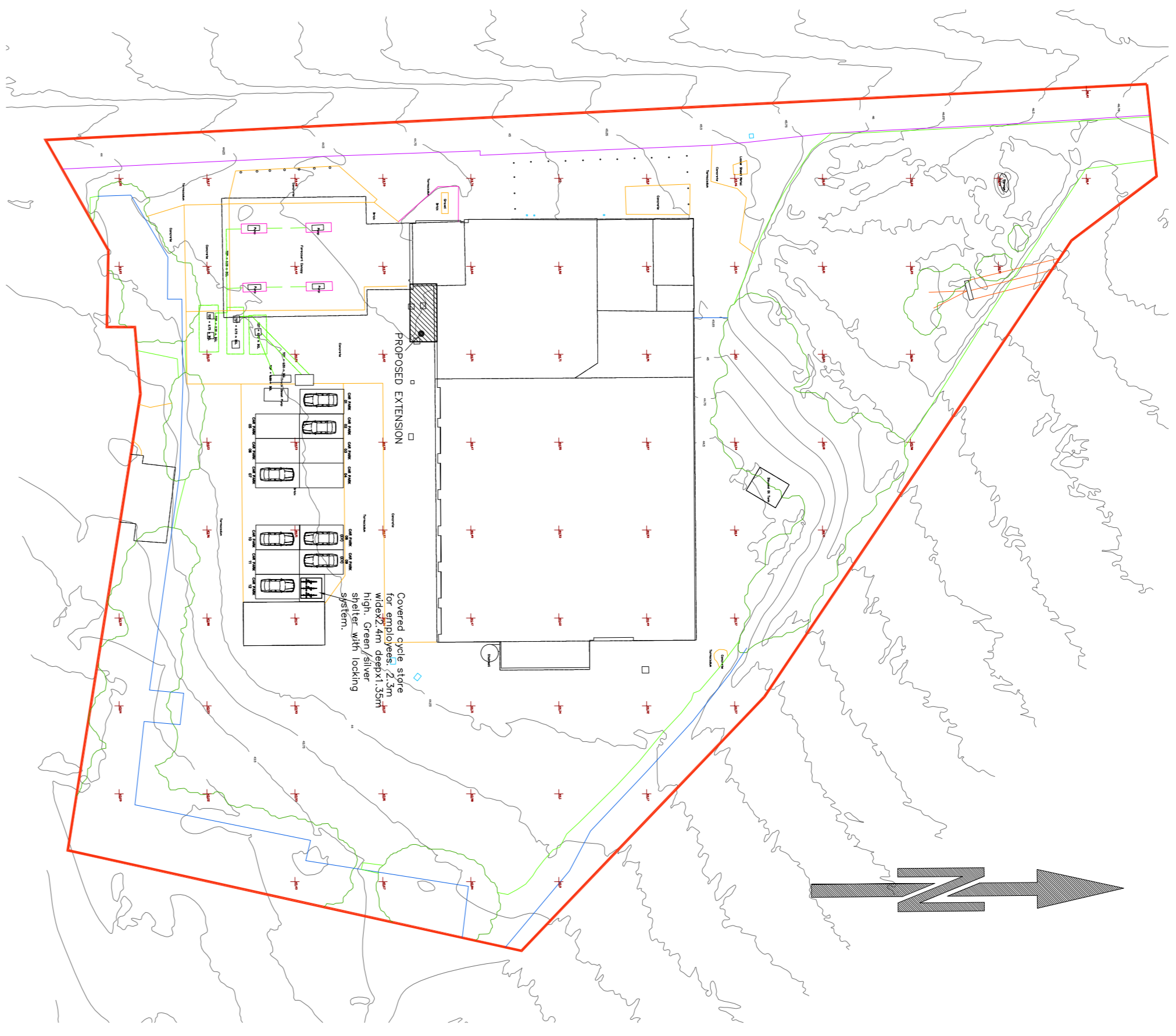
PROPOSED BLOCK PLAN (1:500)

Rev. A – proposed carports & Cycle store added. 31 Oct. 2023