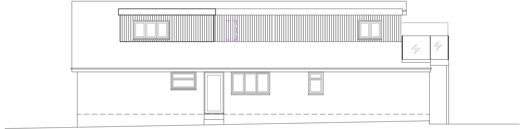
SIDE (W): PROPOSED