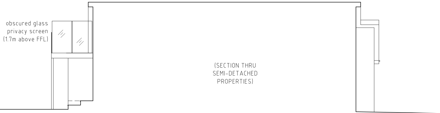
SIDE (E): PROPOSED

SCHEDULE OF MATERIALS: DORMER SIDES- VERTICAL FIBRE CEMENT CLADDING (GREY) GF WALLS- INSULATED RENDER (WHITE) WINDOWS/DOORS- UPVC (WHITE) SLIDING DOORS- POWDER COATED ALUMINIUM (WHITE)