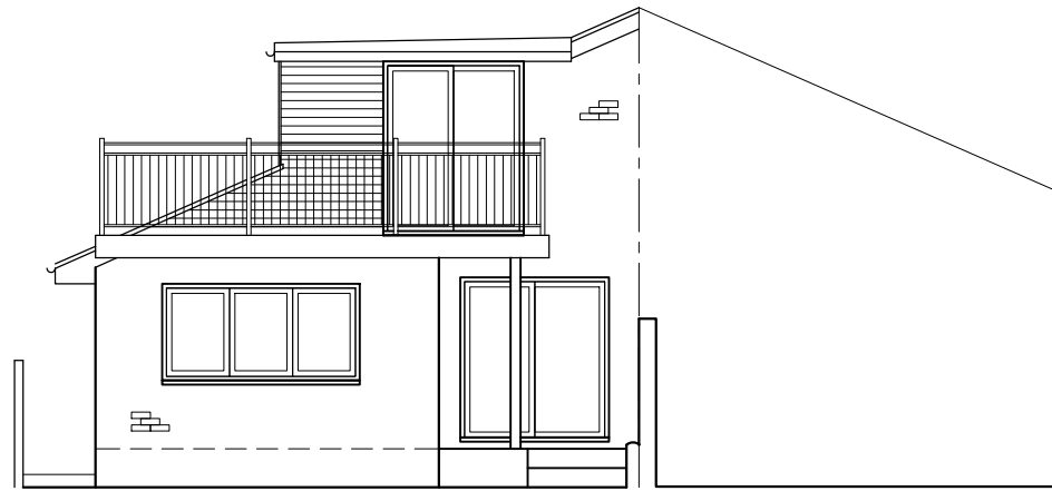
REAR (S): EXISTING 1:100