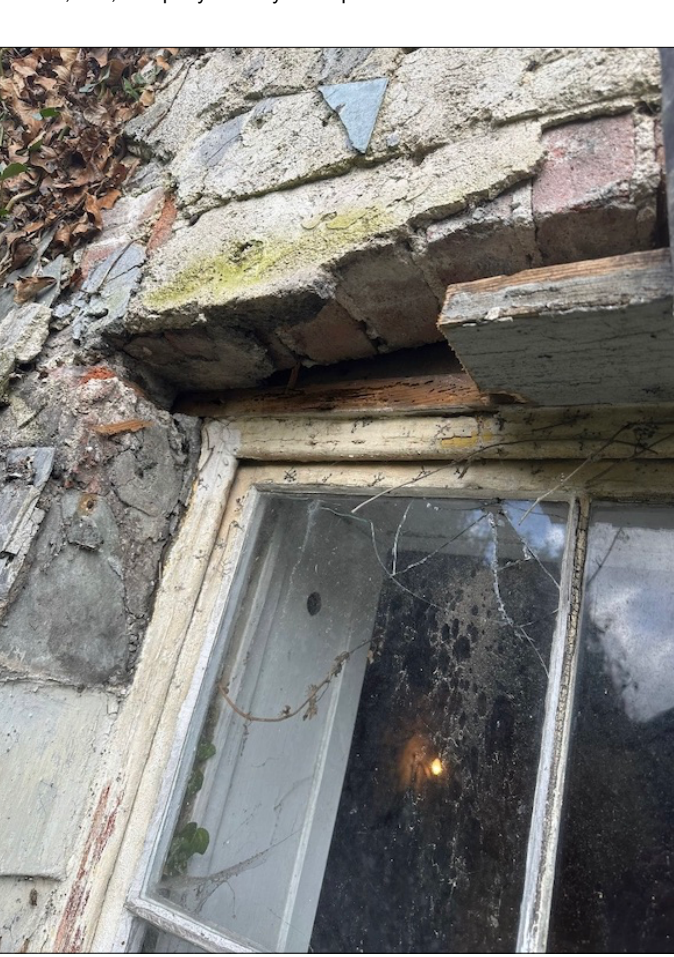
There are signs of previous repairs to sills, stiles, and meeting rails