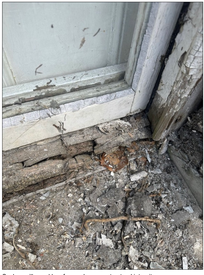
Sashes, sills, and box frames have no structural integrity