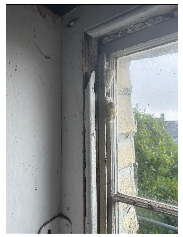
Nonfunctional sashes have been packed with tissue to reduce drafts