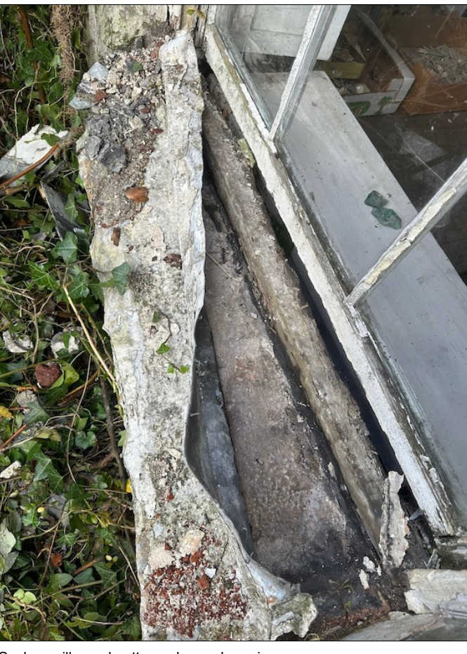
Sashes, sills, and putty are beyond repair