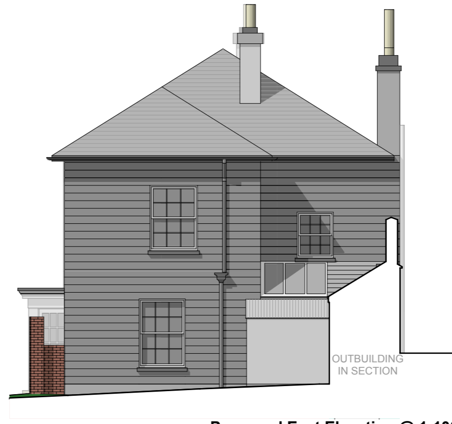
Proposed East Elevation @ 1:100