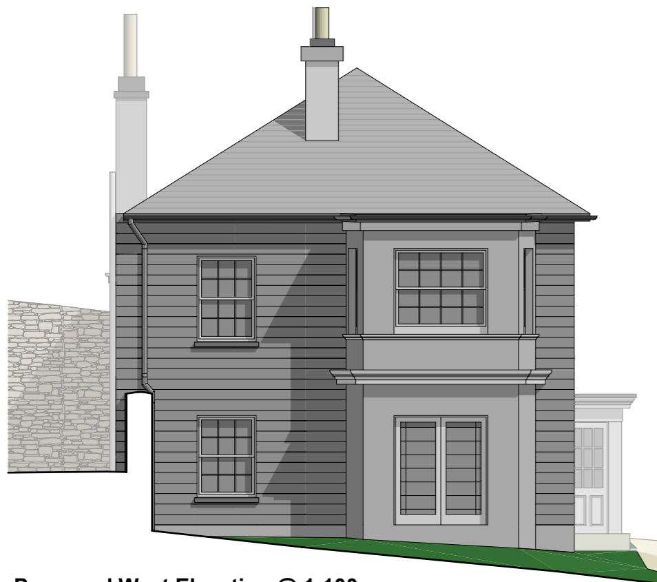
Proposed West Elevation @ 1:100