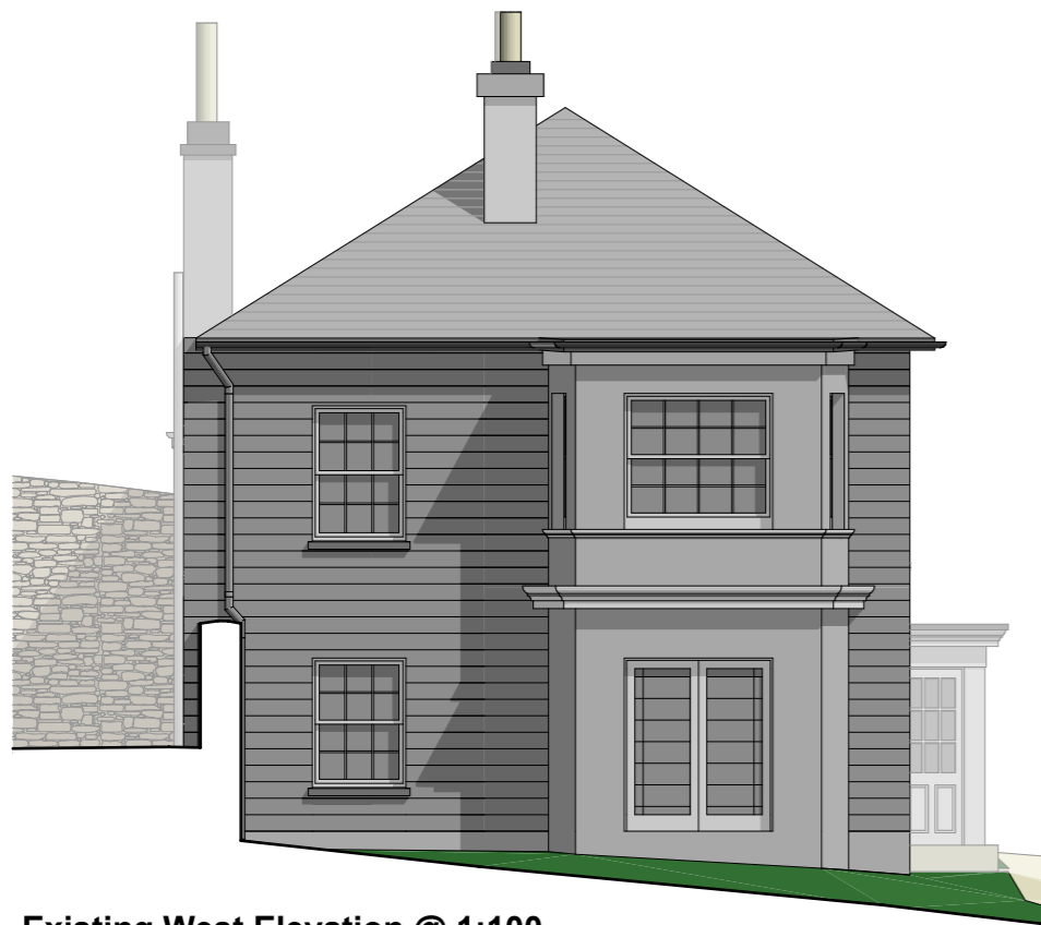
Existing West Elevation @ 1:100