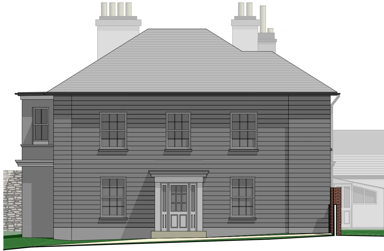
Existing South Elevation @ 1:100