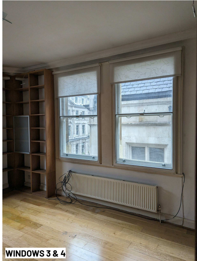
WINDOWS 3 & 4