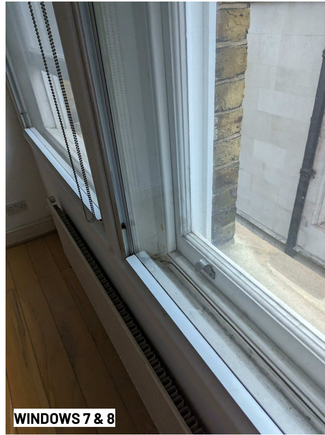
WINDOWS 7 & 8