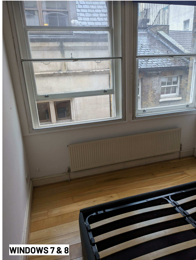
WINDOWS 7 & 8