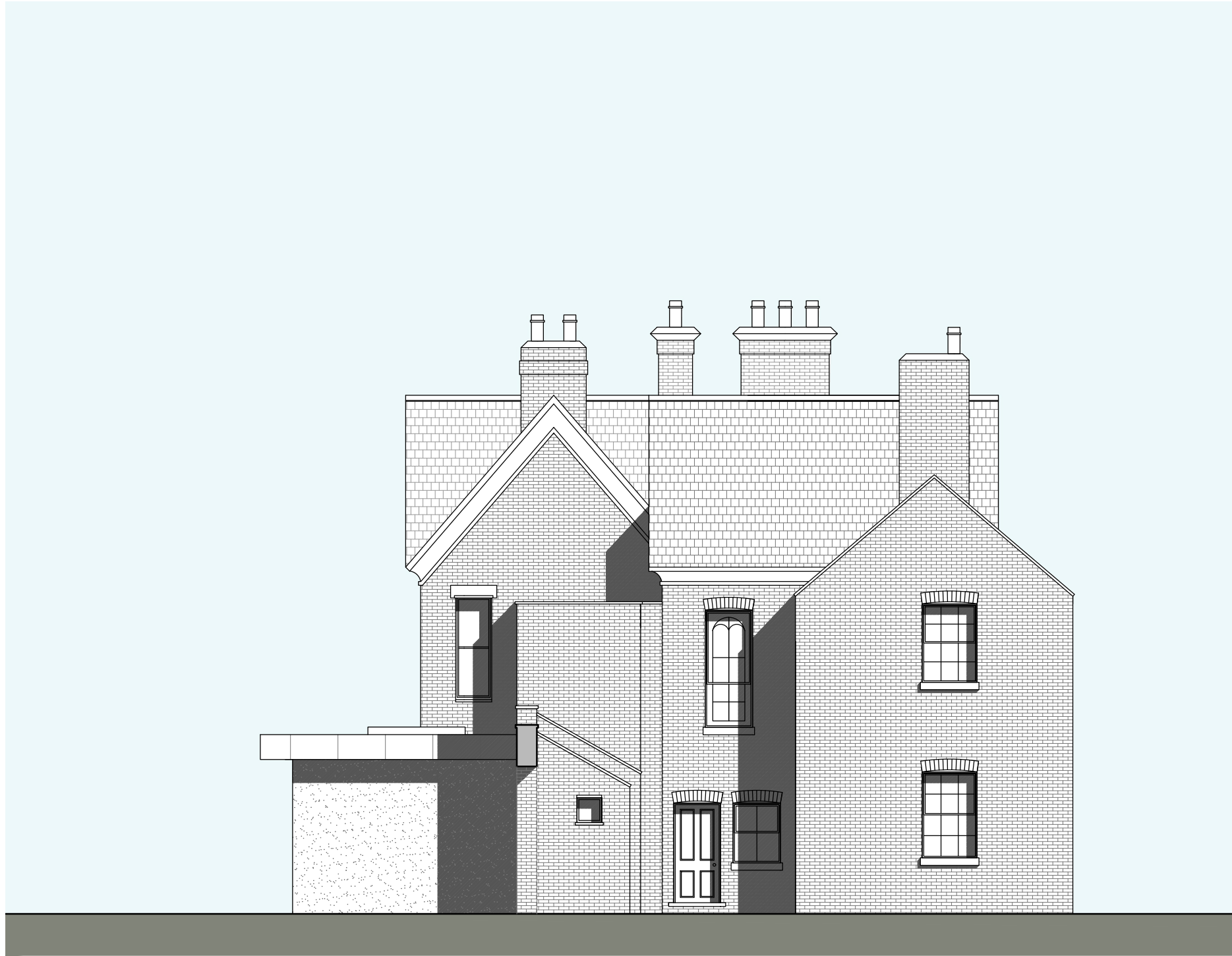
01 PROPOSED SIDE ELEVATION 1:100