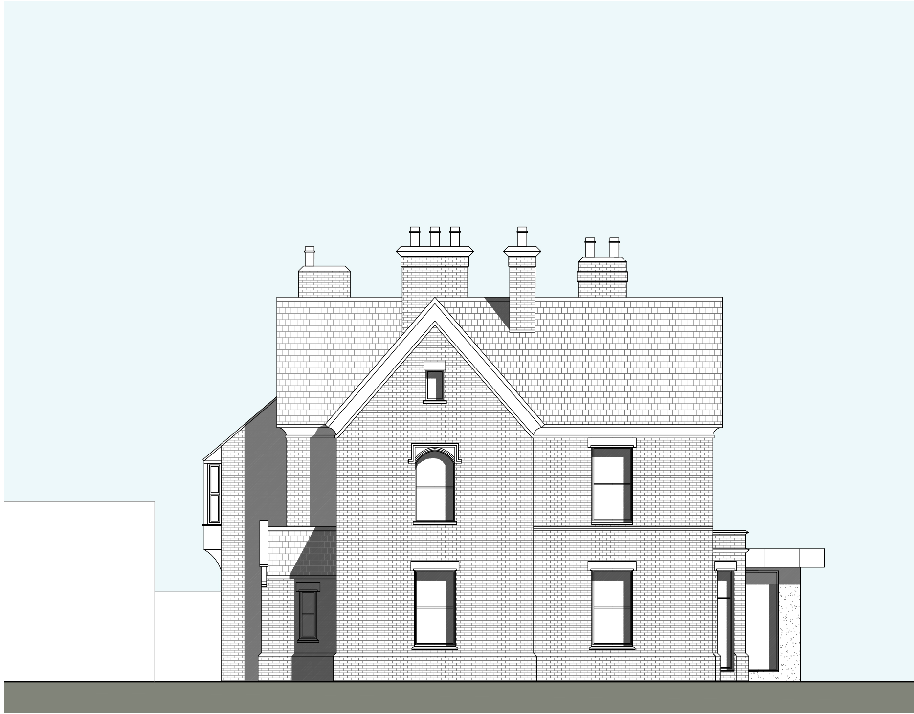
01 PROPOSED SIDE ELEVATION 1:100