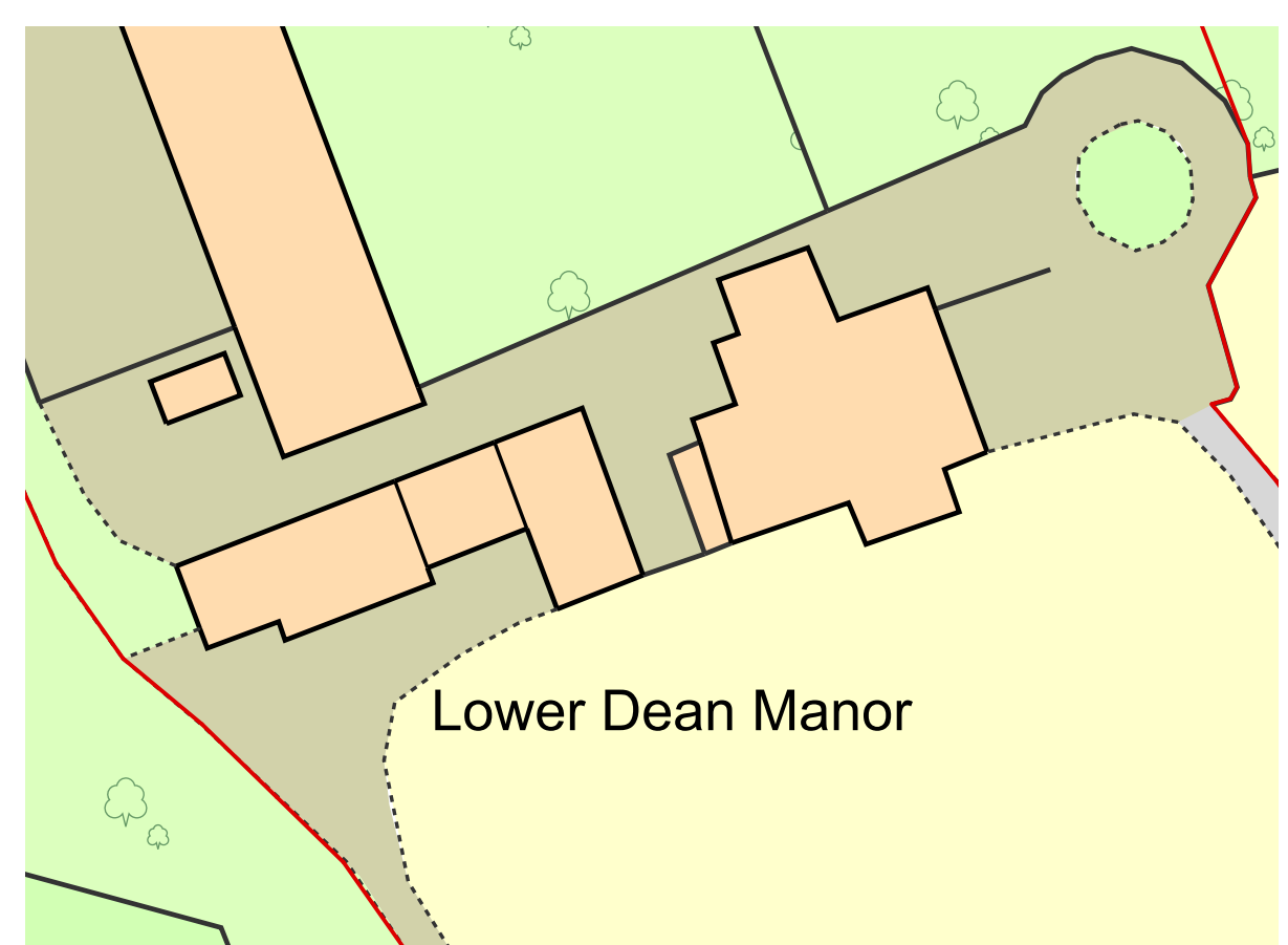
EXISTING BLOCK PLAN Scale: 1:500

Application Boundary Clients land ownership