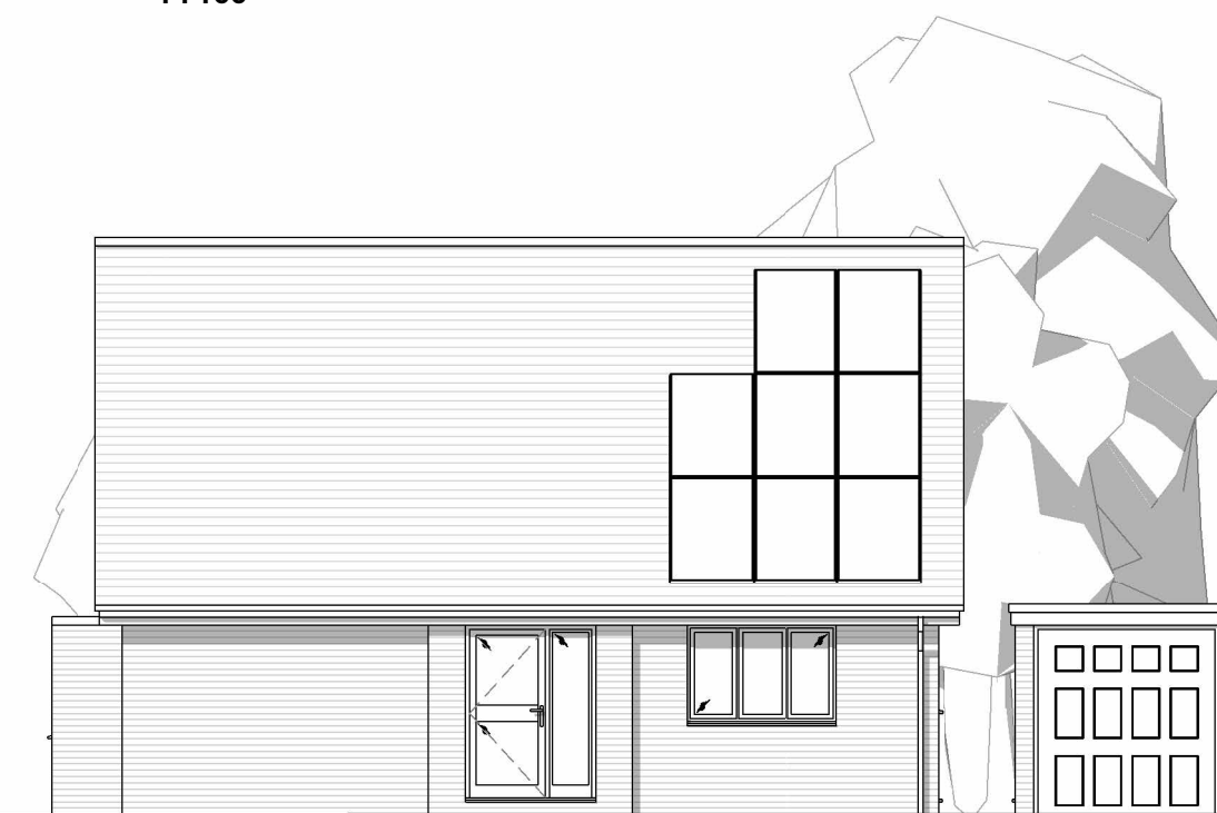
Existing Front Elevation 1 : 100