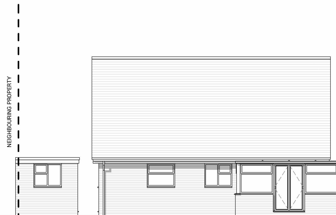
Existing Rear Elevation 1 : 100