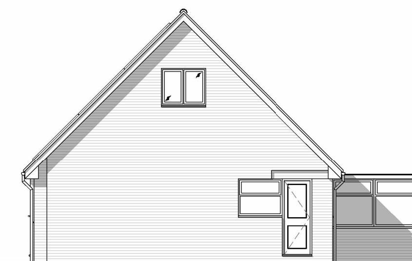
Existing Side Elevation 2 1 : 100