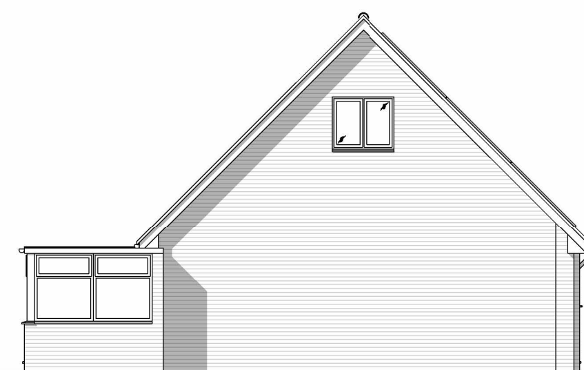
Existing Side Elevation 1 1 : 100