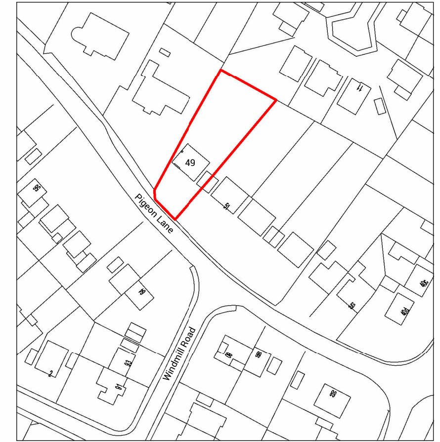
Site Location Plan 1 : 1250