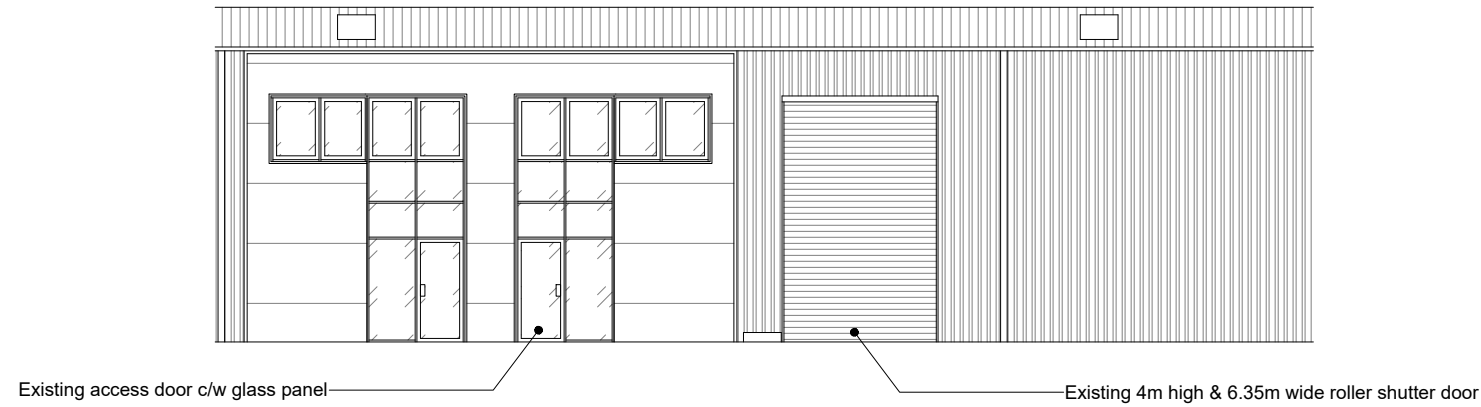
Existing South-West Site Elevation (Scale 1:200)