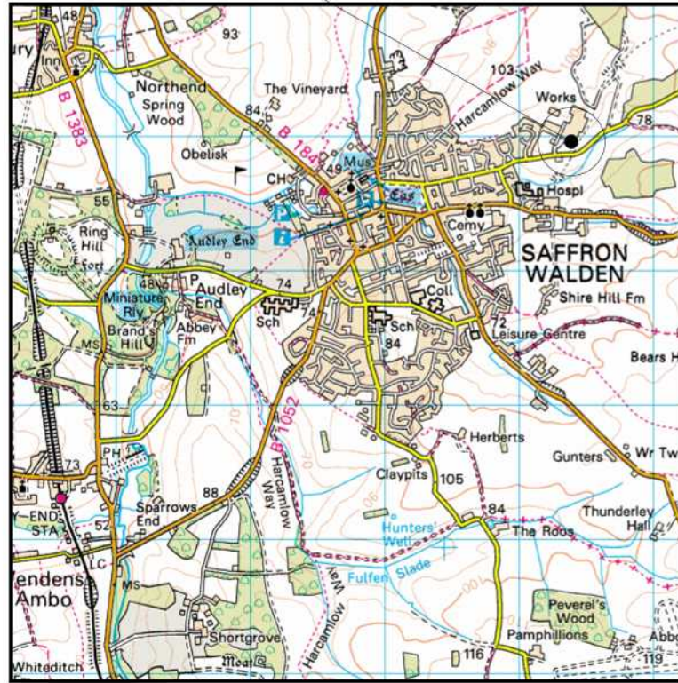
Site Location Plan (Scale 1:50,000)