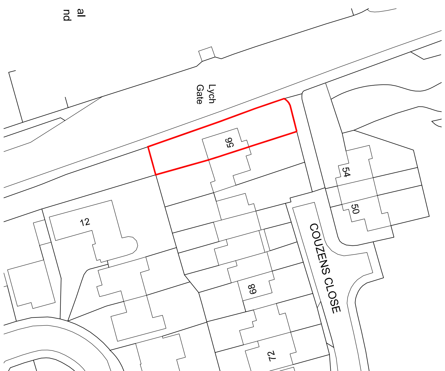
Site Plan as Existing - 1:500