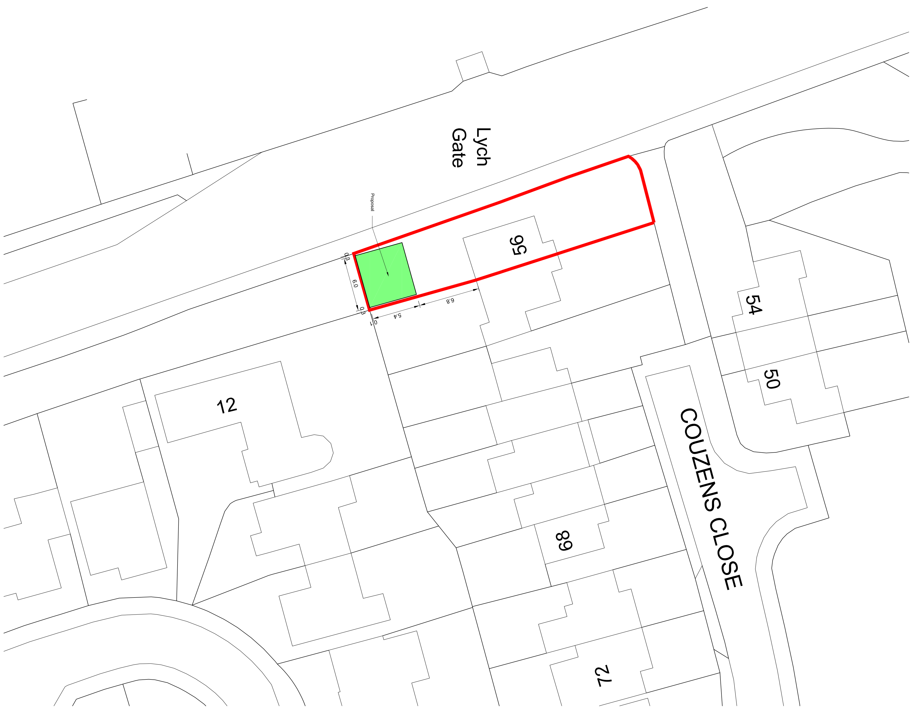
Site Plan as Proposed - 1:200