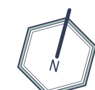
SITE PLAN Scale: 1:100