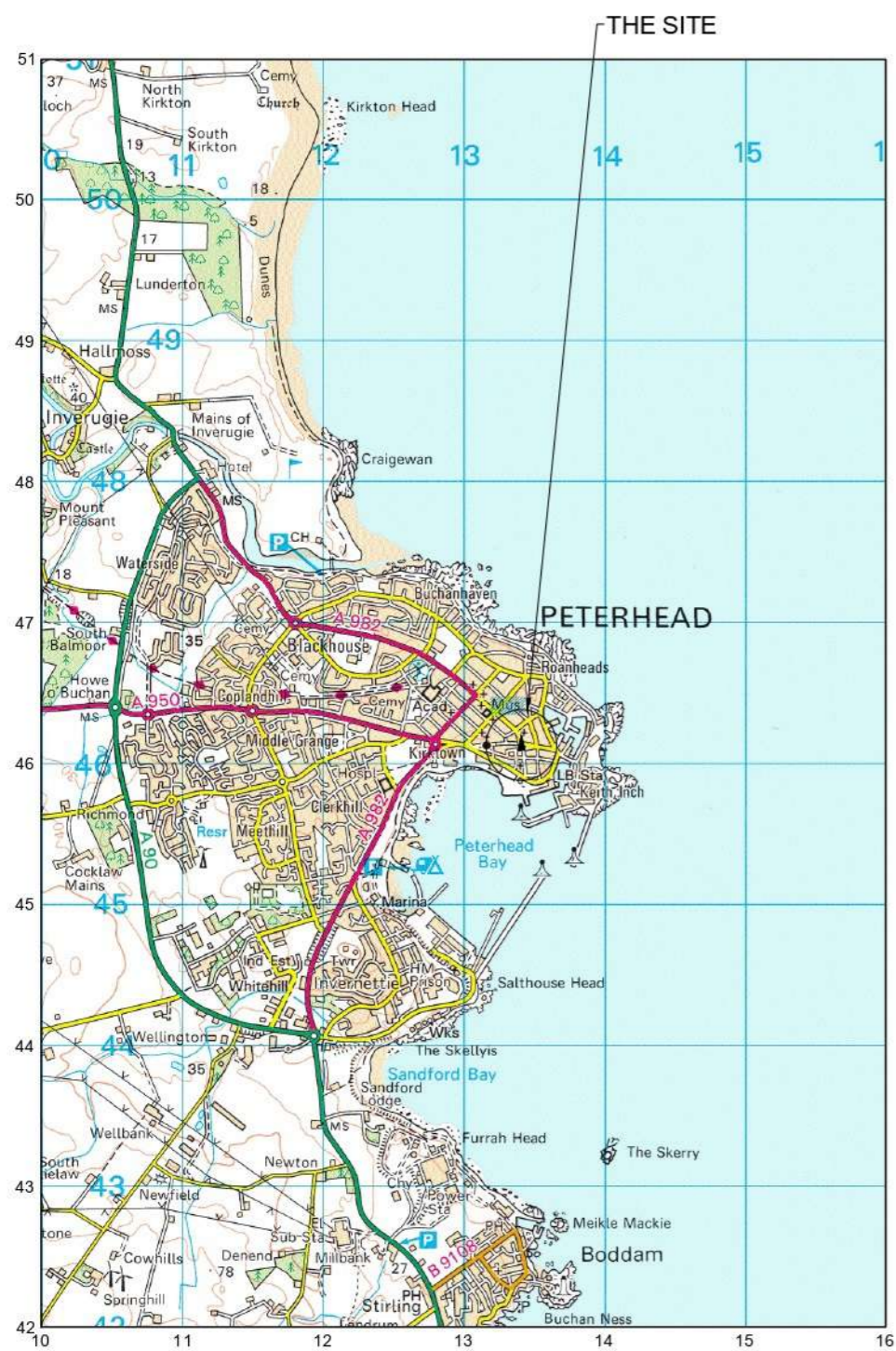
LOCATION PLAN SCALE 1:50,000